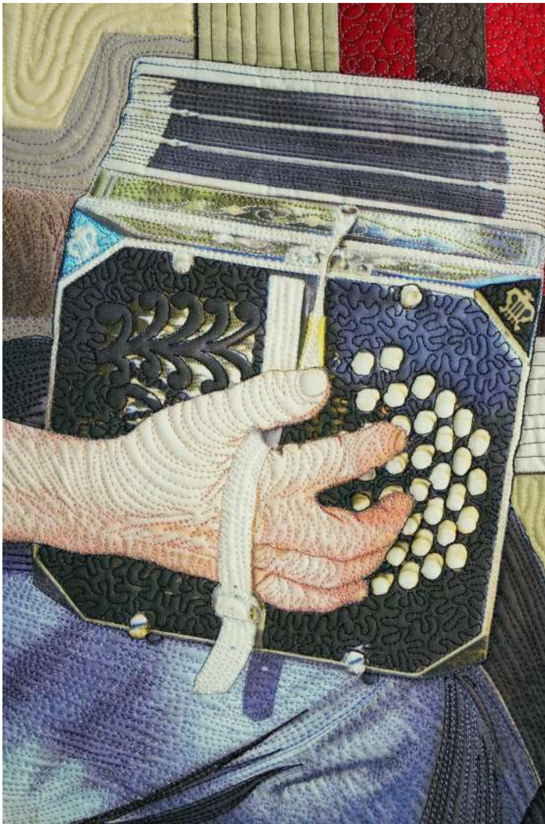
Bandoneon (detail) • 30" x 29.5" • Copyright 2017 Caryl Bryer Fallert-Gentry • www.bryerpatch.com