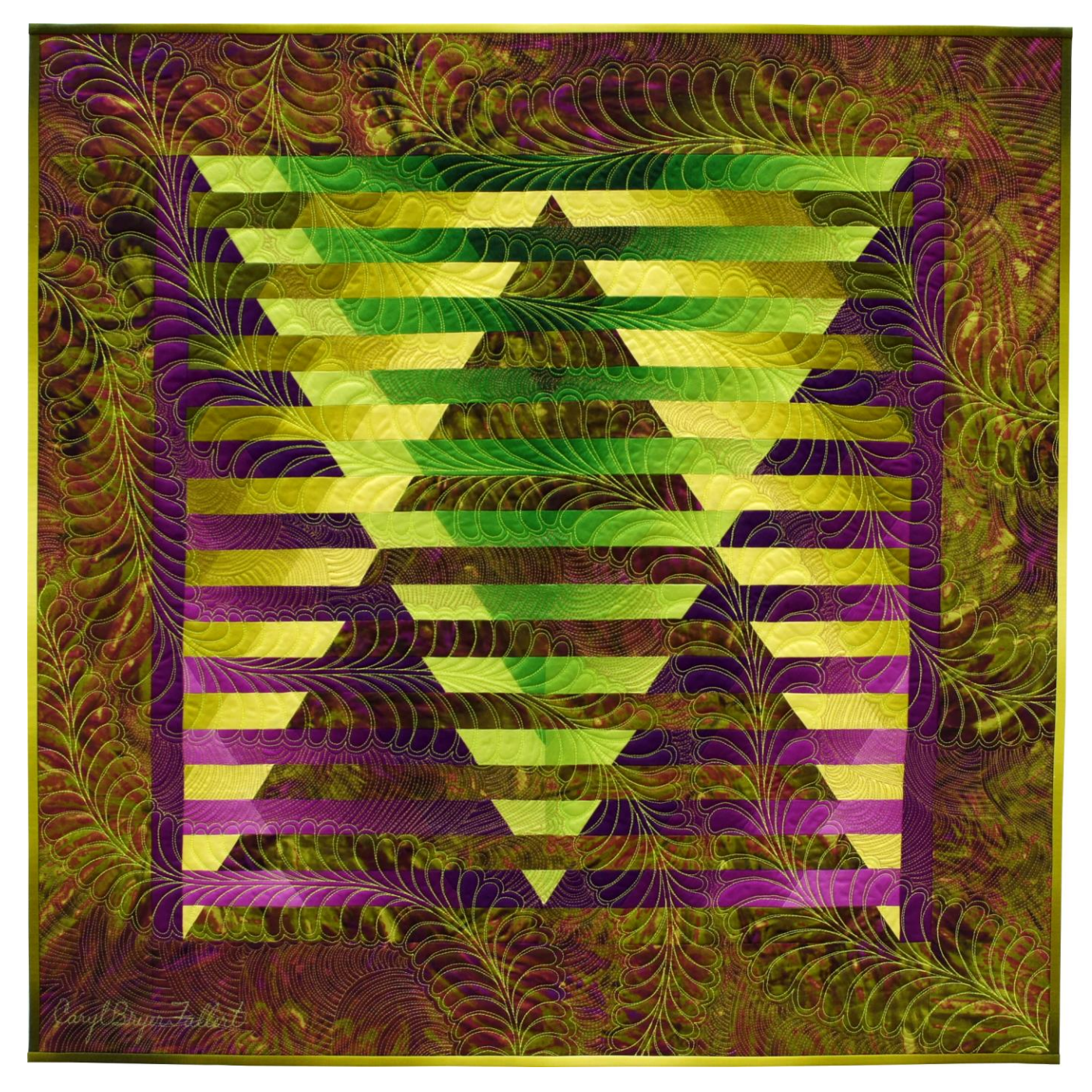
Illusion #50 • 30" x 30" • Copyright © 2012 Caryl Bryer Fallert • Bryerpatch Studio • <u>www.bryerpatch.com</u>