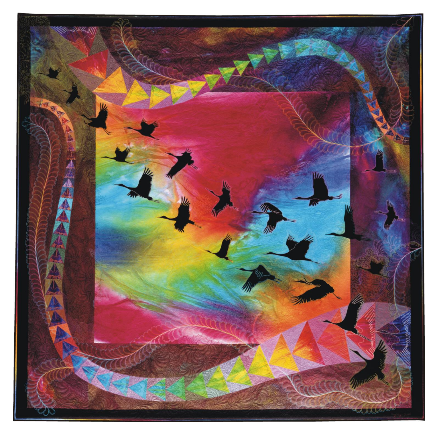
Migration #2 • 88" x 88" • Copyright © 1995 Caryl Bryer Fallert • Bryerpatch Studio • www.bryerpatch.com