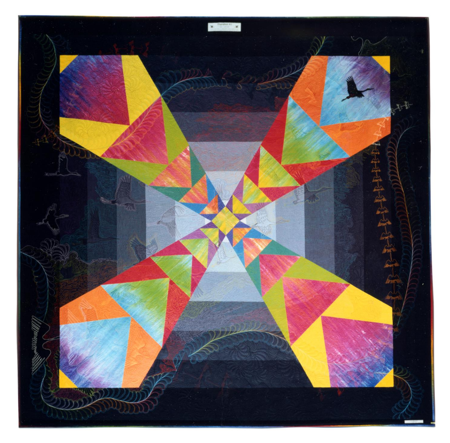
Migration #2 (back of quilt) • 88" x 88" • Copyright © 1995 Caryl Bryer Fallert • Bryerpatch