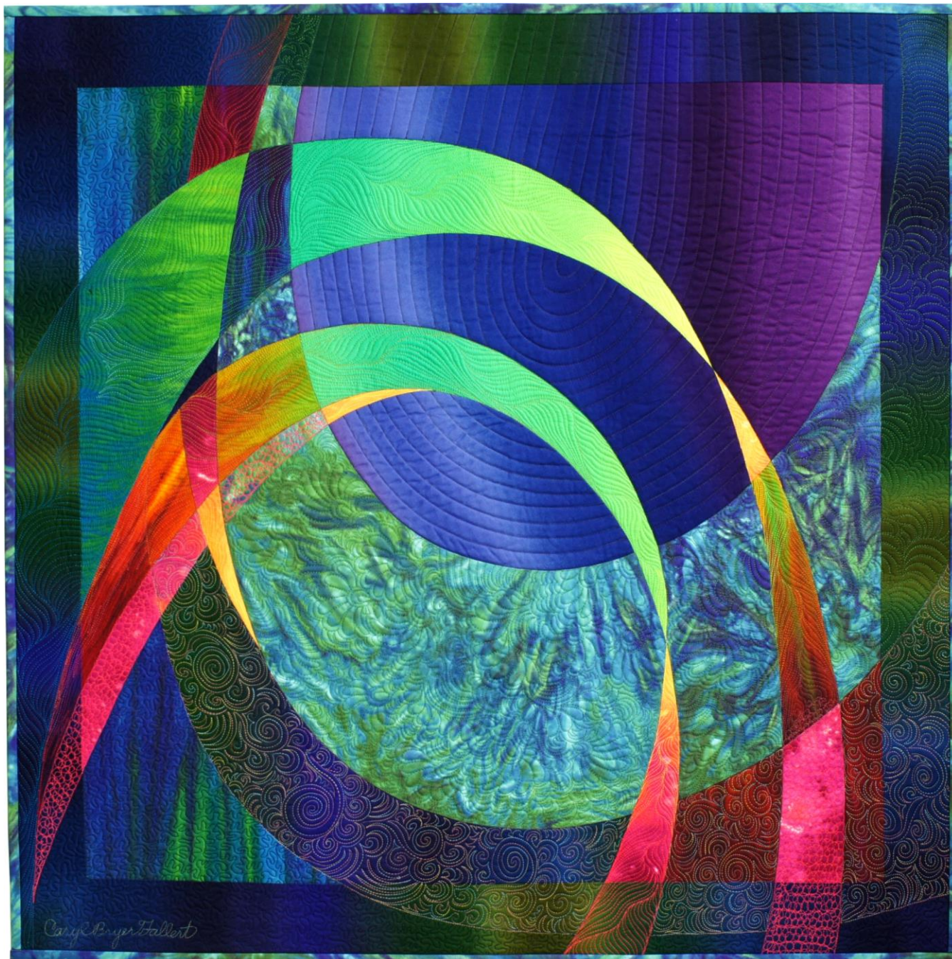
Out of the Blue #4 • 30" x 30" • Copyright © 2012 Caryl Bryer Fallert • Bryerpatch Studio • www.bryerpatch.com

Bryerpatch Studio • 10 Baycliff Pl. • Port Townsend, WA 98368 • caryl@bryerpatch.com • www.bryerpatch.com