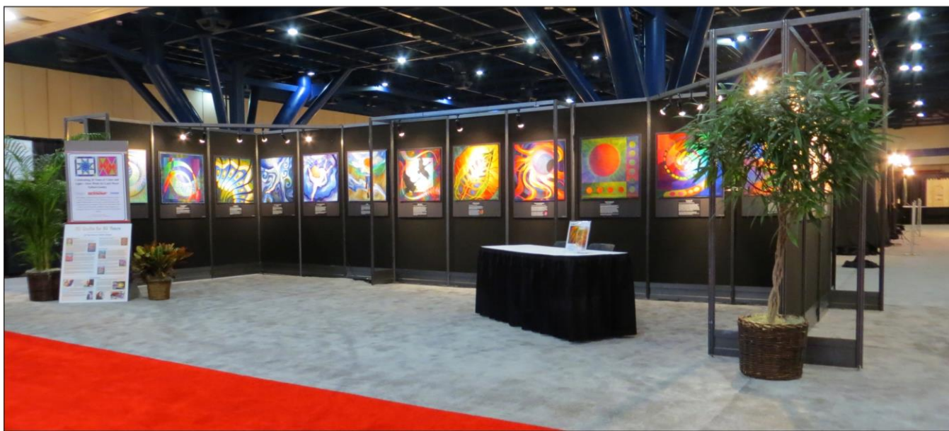
Installation at International Quilt Market & Festival, 2013, Houston, TX