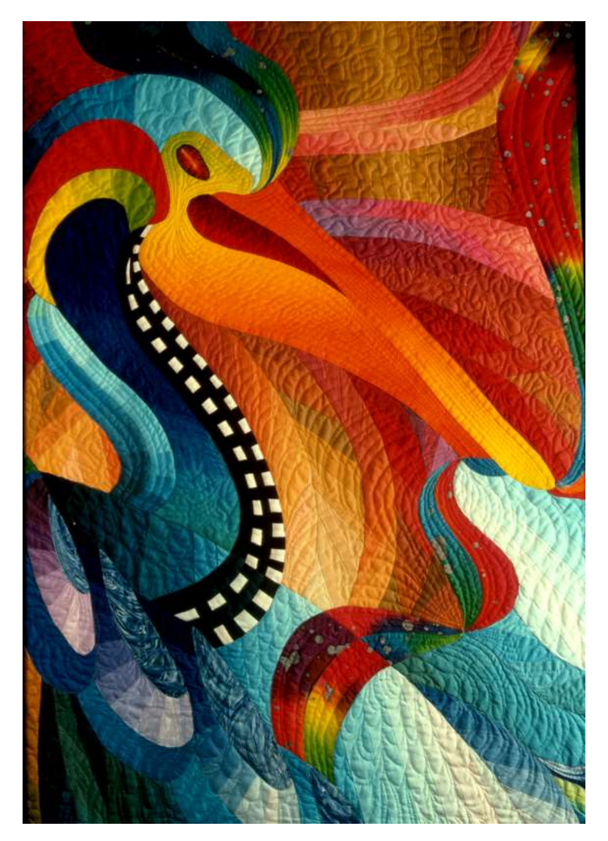
Cosmic Pelican • 68" x 58" • Copyright © 1992 Caryl Bryer Fallert • Bryerpatch Studio • www.bryerpatch.com

Bryerpatch Studio • 10 Baycliff Pl. • Port Townsend, WA 98368 • caryl @bryerpatch.com • www.bryerpatch.com