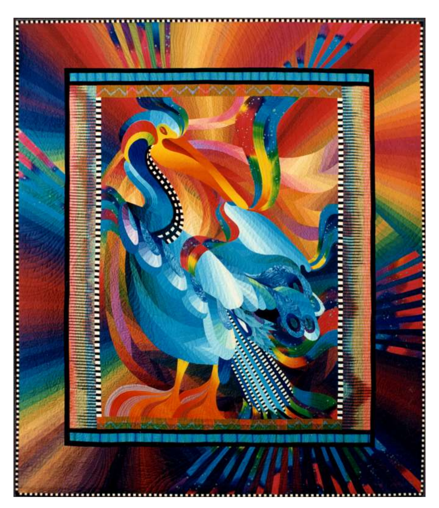
Cosmic Pelican • 68" x 58" • Copyright © 1992 Caryl Bryer Fallert • Bryerpatch Studio • www.bryerpatch.com

Bryerpatch Studio • 10 Baycliff Pt. • Port Townsend, WA 98368 • caryl @bryerpatch.com • www.bryerpatch.com