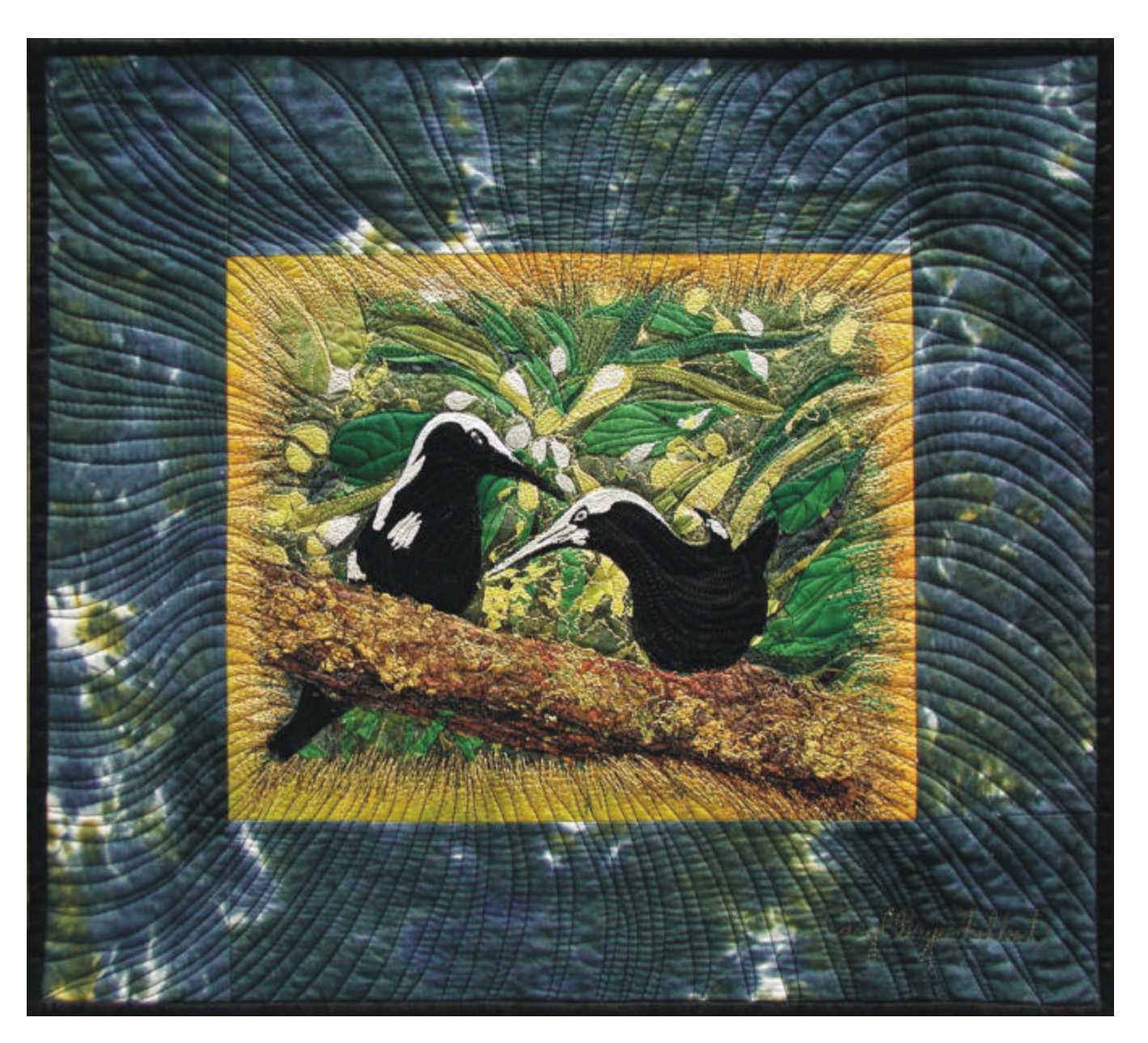
Noddy Terns • 17" x 19"• Copyright© 2000 Caryl Bryer Fallert • Bryerpatch Studio • www.bryerpatch.com