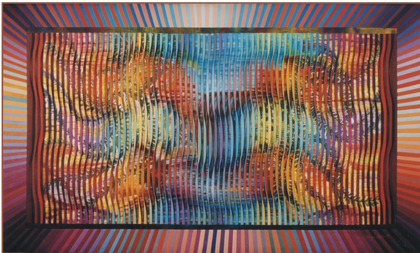
Reflection #3 • 77" x 45" • © 1990 Caryl Bryer Fallert