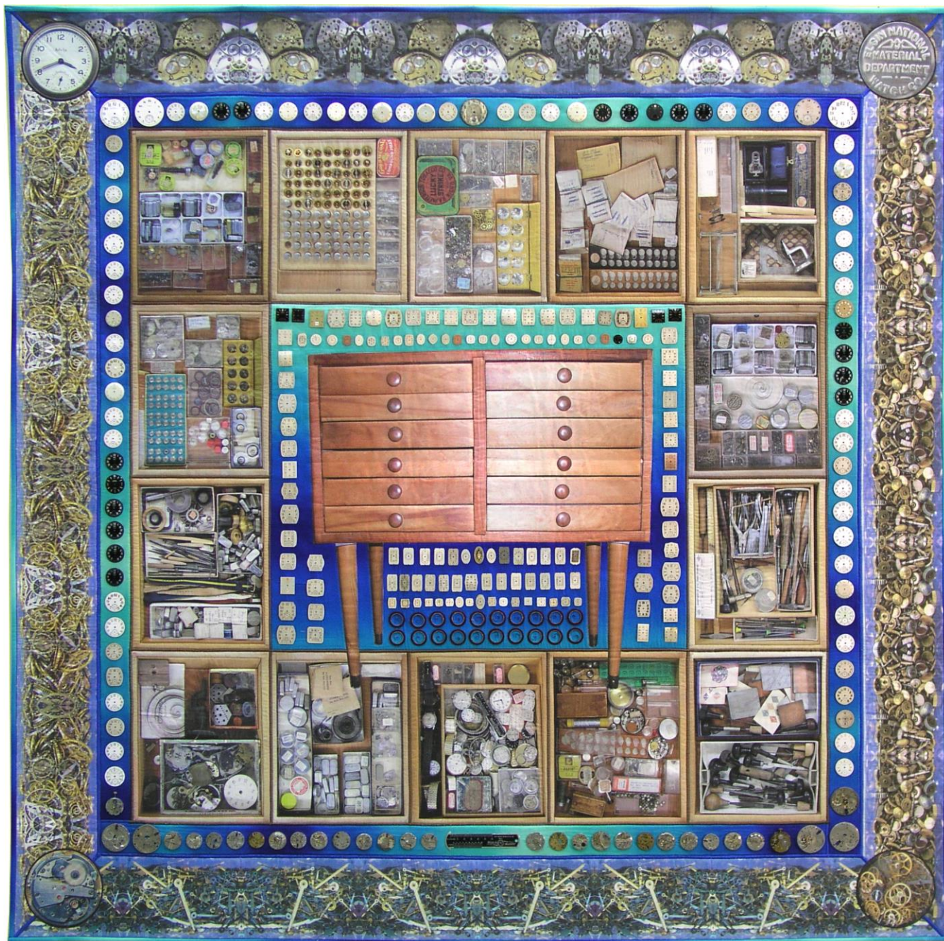
Watch Master • 53.5" x 53.5" • Copyright © 2008 Caryl Bryer Fallert • www.bryerpatch.com

Bryerpatch Studio • 10 Baycliff Pl. • Port Townsend, WA 98368 • caryl@bryerpatch.com • www.bryerpatch.com