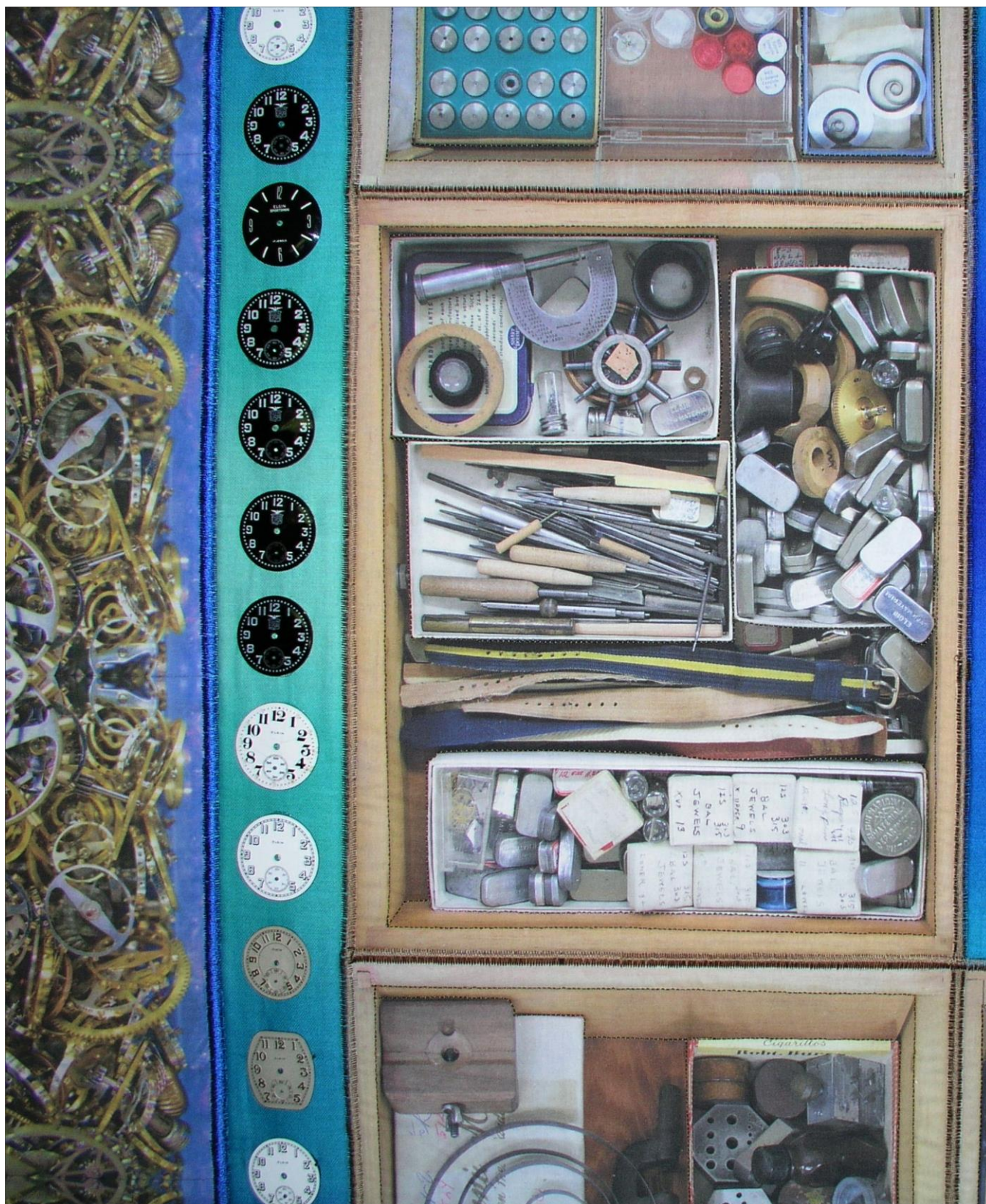
Watch Master (detail) • 53.5" x 53.5" • Copyright © 2008 Caryl Bryer Fallert • www.bryerpatch.com

Bryerpatch Studio • 10 Baycliff Pl. • Port Townsend, WA 98368 • caryl@bryerpatch.com • www.bryerpatch.com