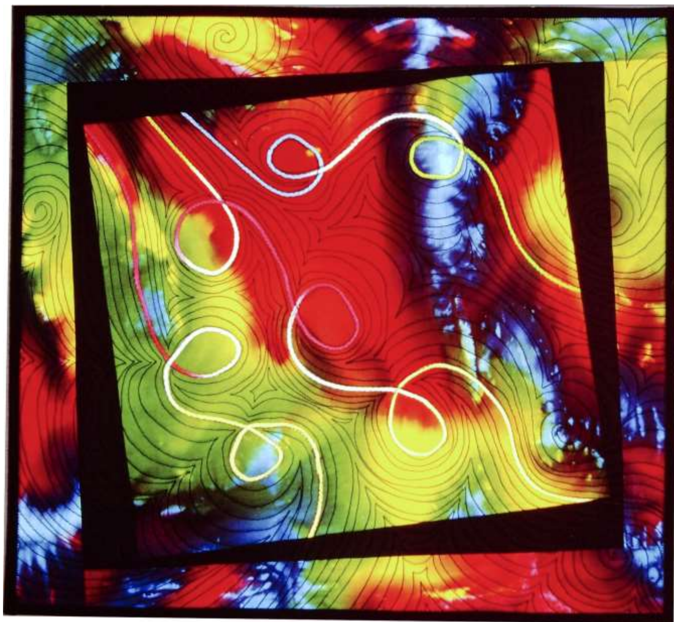
A Little Off Center • +/- 20" x 22" • Copyright © 1996 Caryl Bryer Fallert • www.bryerpatch.com

Bryerpatch Studio • 10 Baycliff Pl. • Port Townsend, WA 98368 • caryl@bryerpatch.com • www.bryerpatch.com