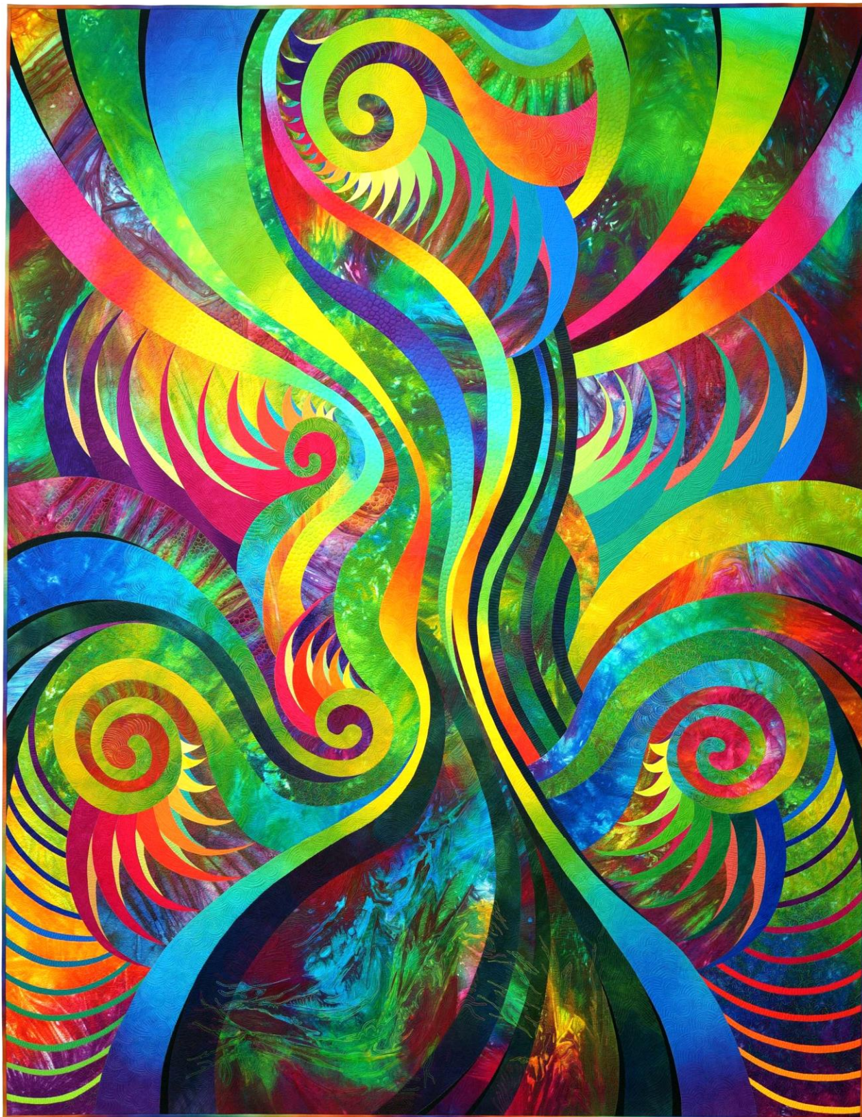
Celebration # • 64" x 84" • Copyright © 2015 Caryl Bryer Fallert-Gentry • www.bryerpatch.com