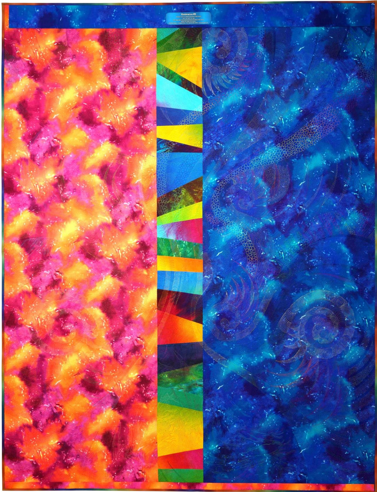
Celebration #2 (detail) • 64" x 84" • Copyright © 2015 Caryl Bryer Fallert-Gentry • Bryerpatch Studio • www.bryerpatch.com

Bryerpatch Studio • 10 Baycliff Pl. • Port Townsend, WA 98368 • caryl@bryerpatch.com • www.bryerpatch.com