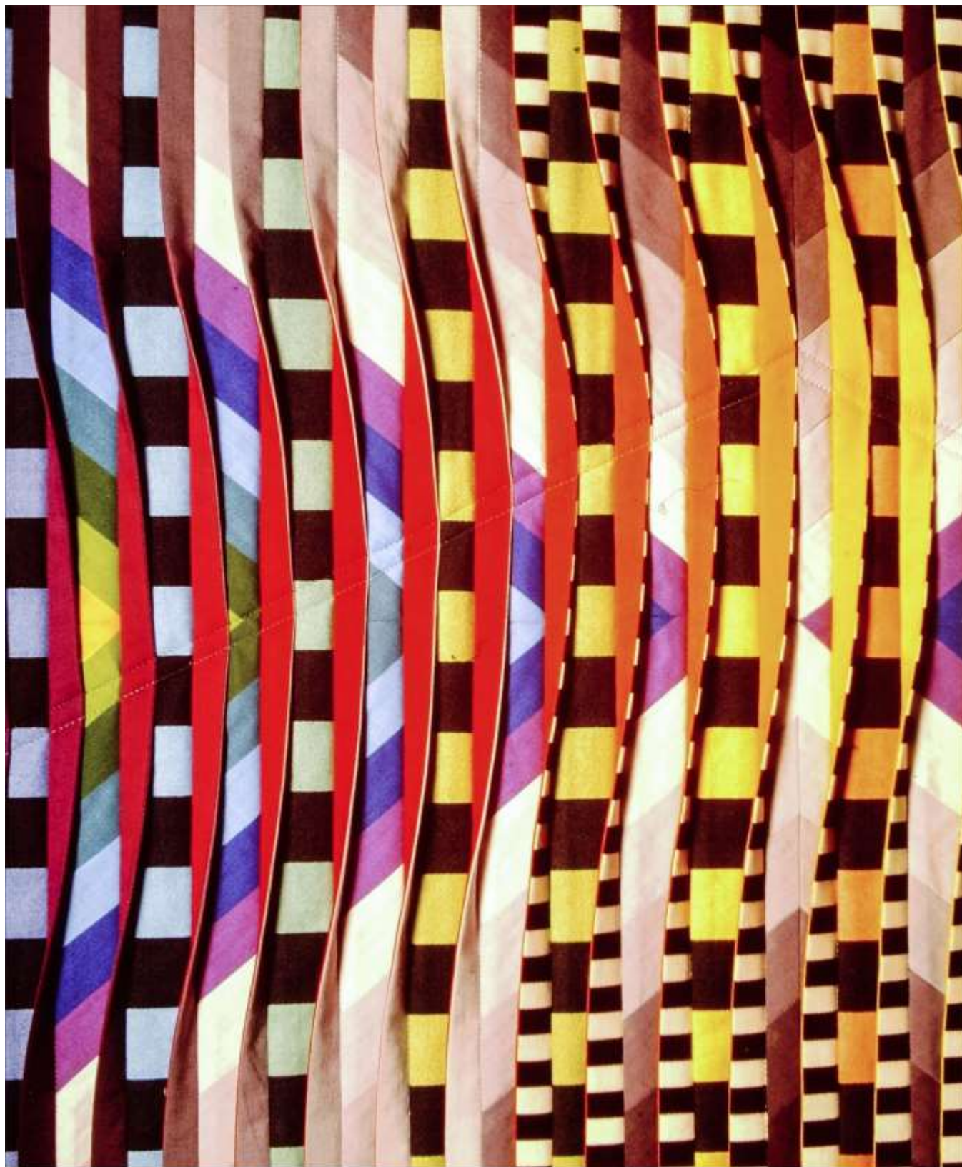
Checking over the Rainbow #18 • 24" x 30" • © 1999 Caryl Bryer Fallert • www.bryerpatch.com

Bryerpatch Studio • 10 Baycliff Pl. • Port Townsend, WA 98368 • caryl@bryerpatch.com • www.bryerpatch.com