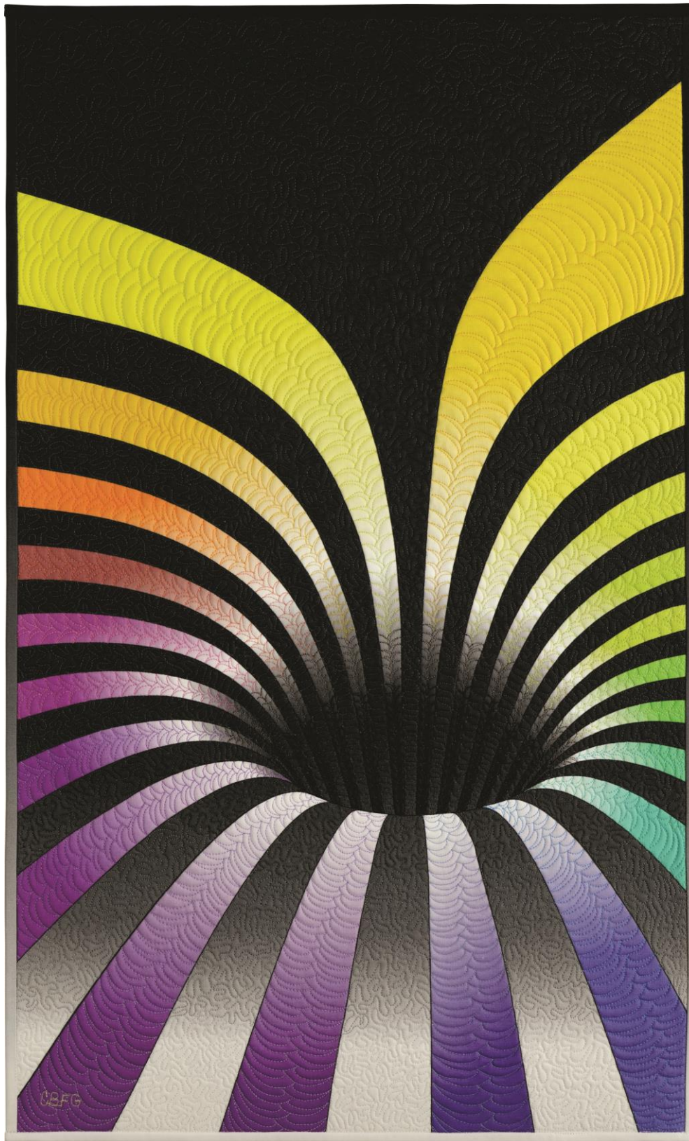
Color Drain #1 • 18" x 29.5" • Copyright © 2024 Caryl Bryer Fallert-Gentry • www.bryerpatch.com