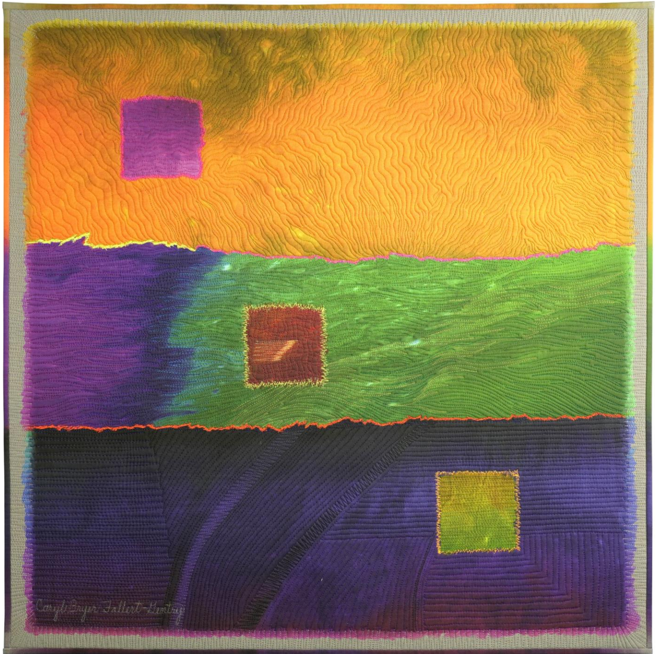
Color Fields #1 • 30" x 30" • Copyright © 2026 Caryl Bryer Fallert-Gentry • www.bryerpatch.com