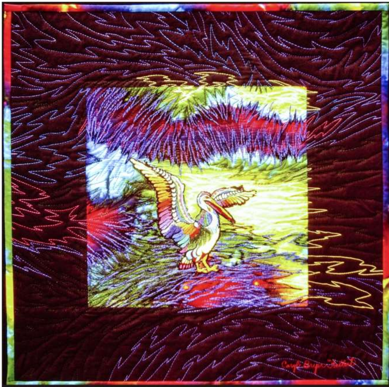
Contemplation of Flight • 20" x 20" • Copyright © 1995 Caryl Bryer Fallert • www.bryerpatch.com

Bryerpatch Studio • 10 Baycliff Pl. • Port Townsend, WA 98368 • caryl@bryerpatch.com • www.bryerpatch.com