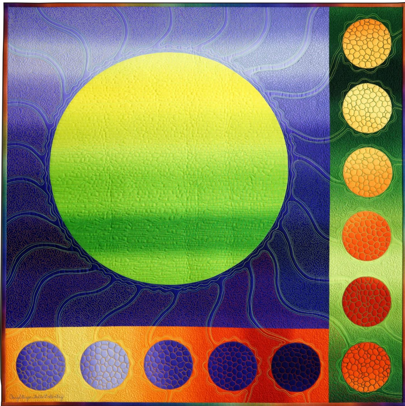
Electric Ellipses #4 • 30" x 30" • Copyright © 2015 Caryl Bryer Fallert-Gentry • Bryerpatch Studio • www.bryerpatch.com

Bryerpatch Studio • 10 Baycliff Pl. • Port Townsend, WA 98368 • caryl@bryerpatch.com • www.bryerpatch.com