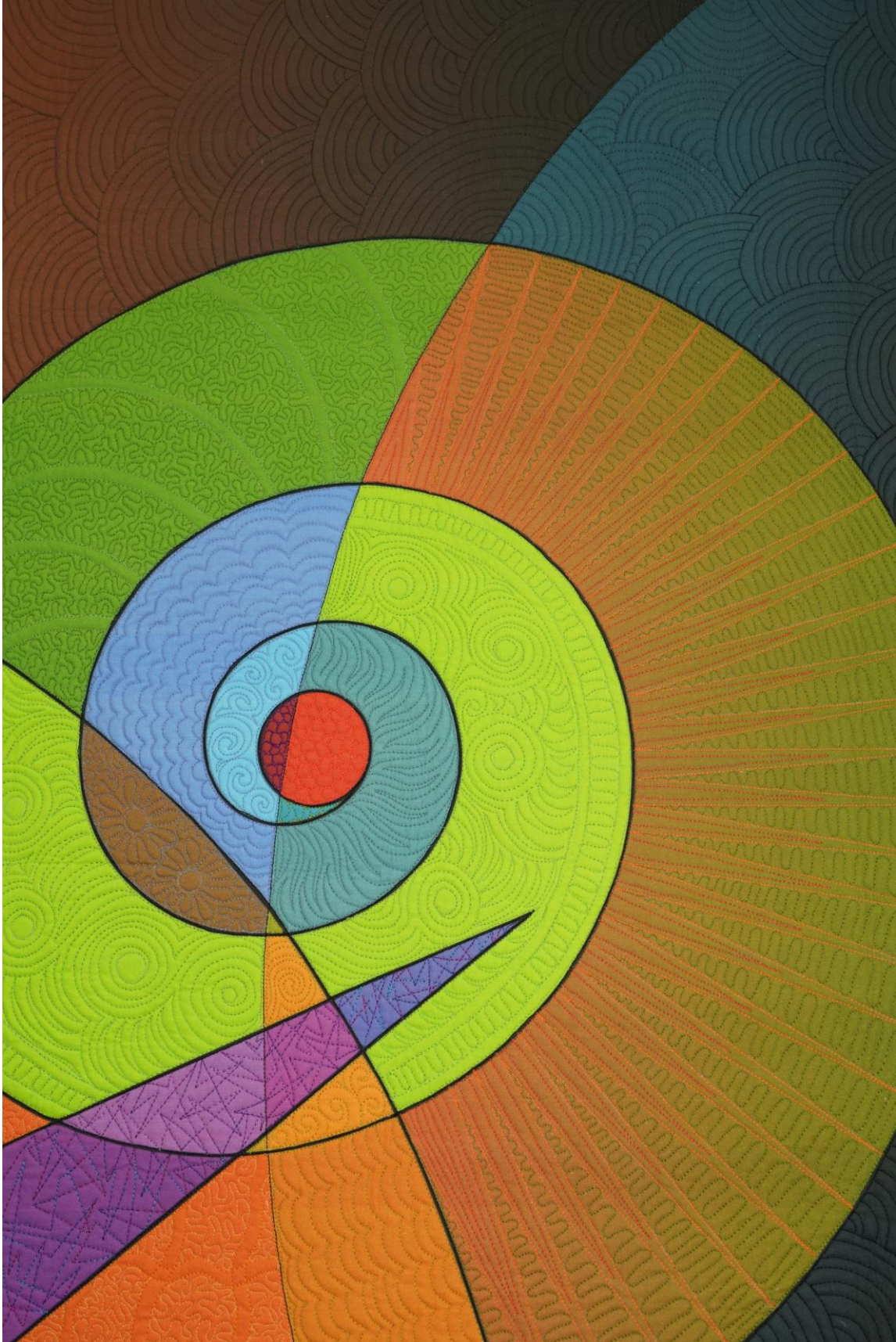
Electric Snails (detail) • 61" x 81" • Copyright © 2023 Caryl Bryer Fallert-Gentry • www.bryerpatch.com

Bryerpatch Studio • 10 Baycliff Pl. • Port Townsend, WA 98368 • caryl@bryerpatch.com • www.bryerpatch.com