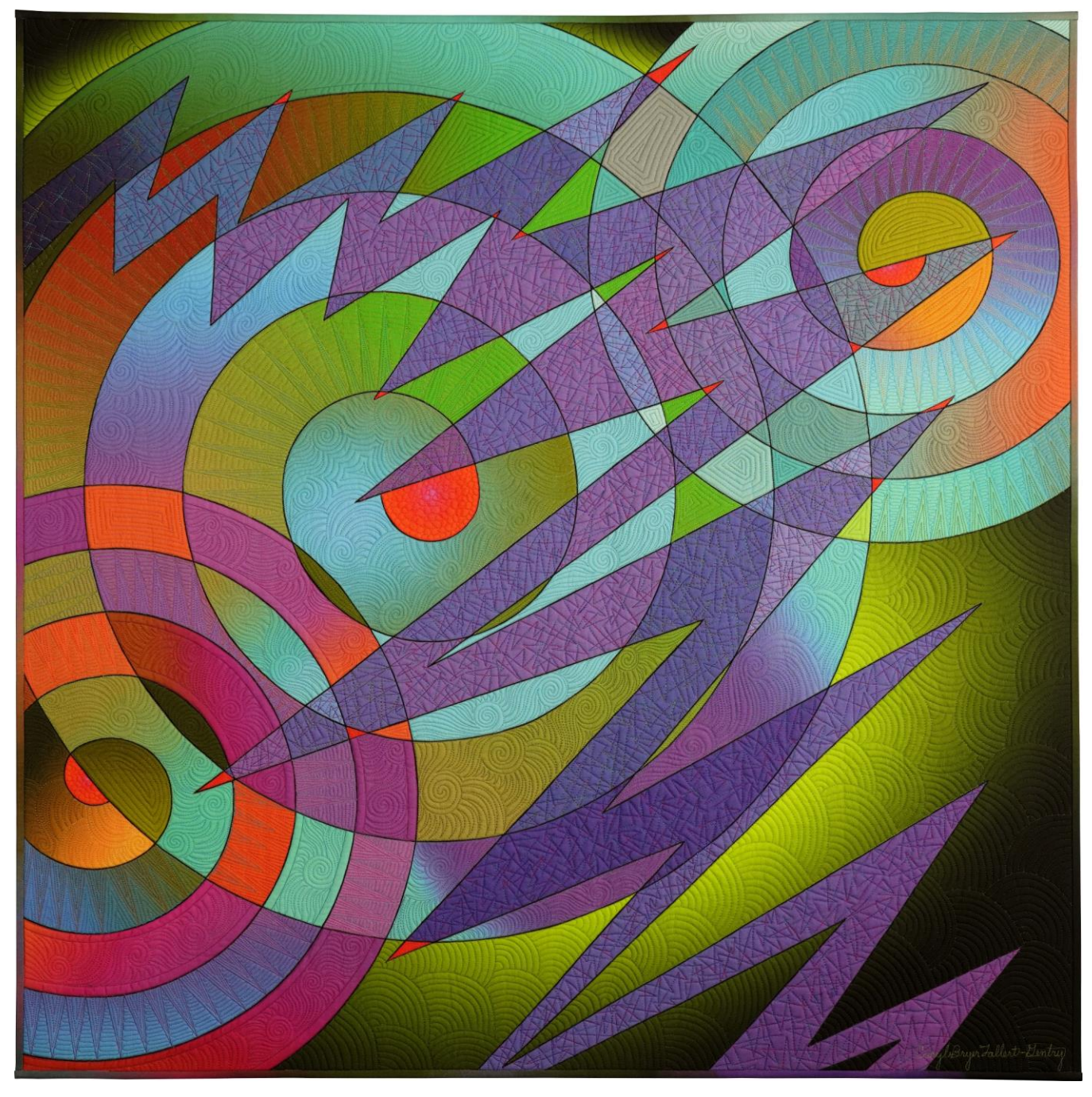
Electric Snails #2 • 40" x 40" • Copyright © 2024 Caryl Bryer Fallert-Gentry • <u>www.bryerpatch.com</u>

Bryerpatch Studio • 10 Baycliff Pl. • Port Townsend, WA 98368 • caryl @bryerpatch.com • www.bryerpatch.com