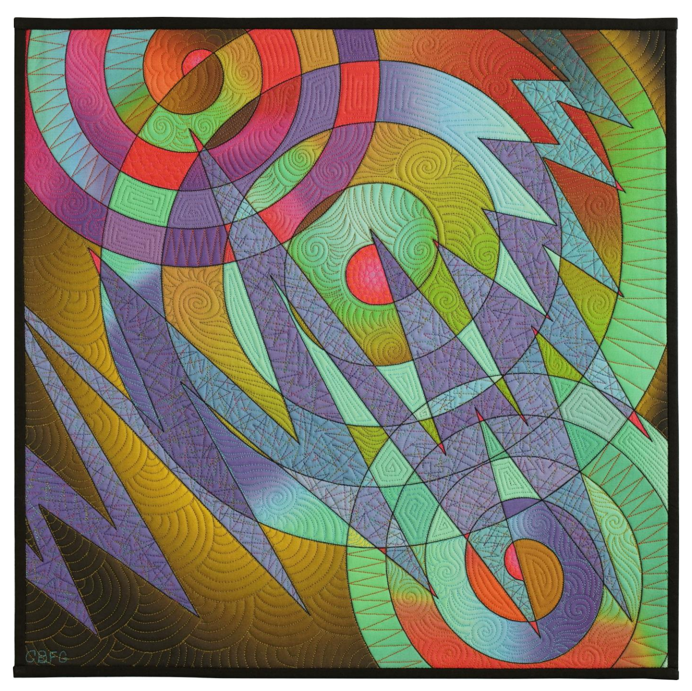
Electric Snails #3 • 18.5" x 18.5" • Copyright © 2024 Caryl Bryer Fallert-Gentry • www.bryerpatch.com

Bryerpatch Studio • 10 Baycliff Pl. • Port Townsend, WA 98368 • caryl @bryerpatch.com • www.bryerpatch.com