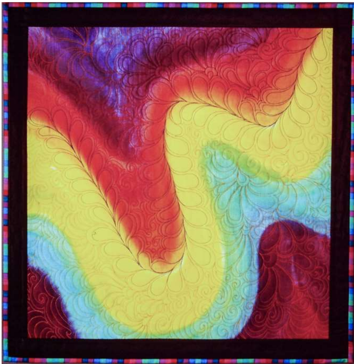
Etude #1 • 23" x 23" • Copyright © 1994 Caryl Bryer Fallert • www.bryerpatch.com

Bryerpatch Studio • 10 Baycliff Pl. • Port Townsend, WA 98368 • caryl@bryerpatch.com • www.bryerpatch.com