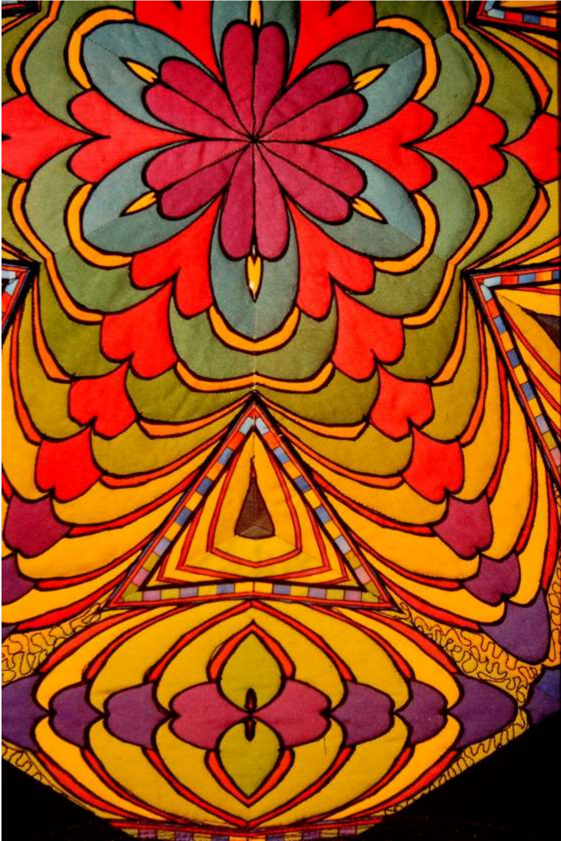
Feather Medallion (detail) • 36" x 36" • © 2000 Caryl Bryer Fallert • www.bryerpatch.com