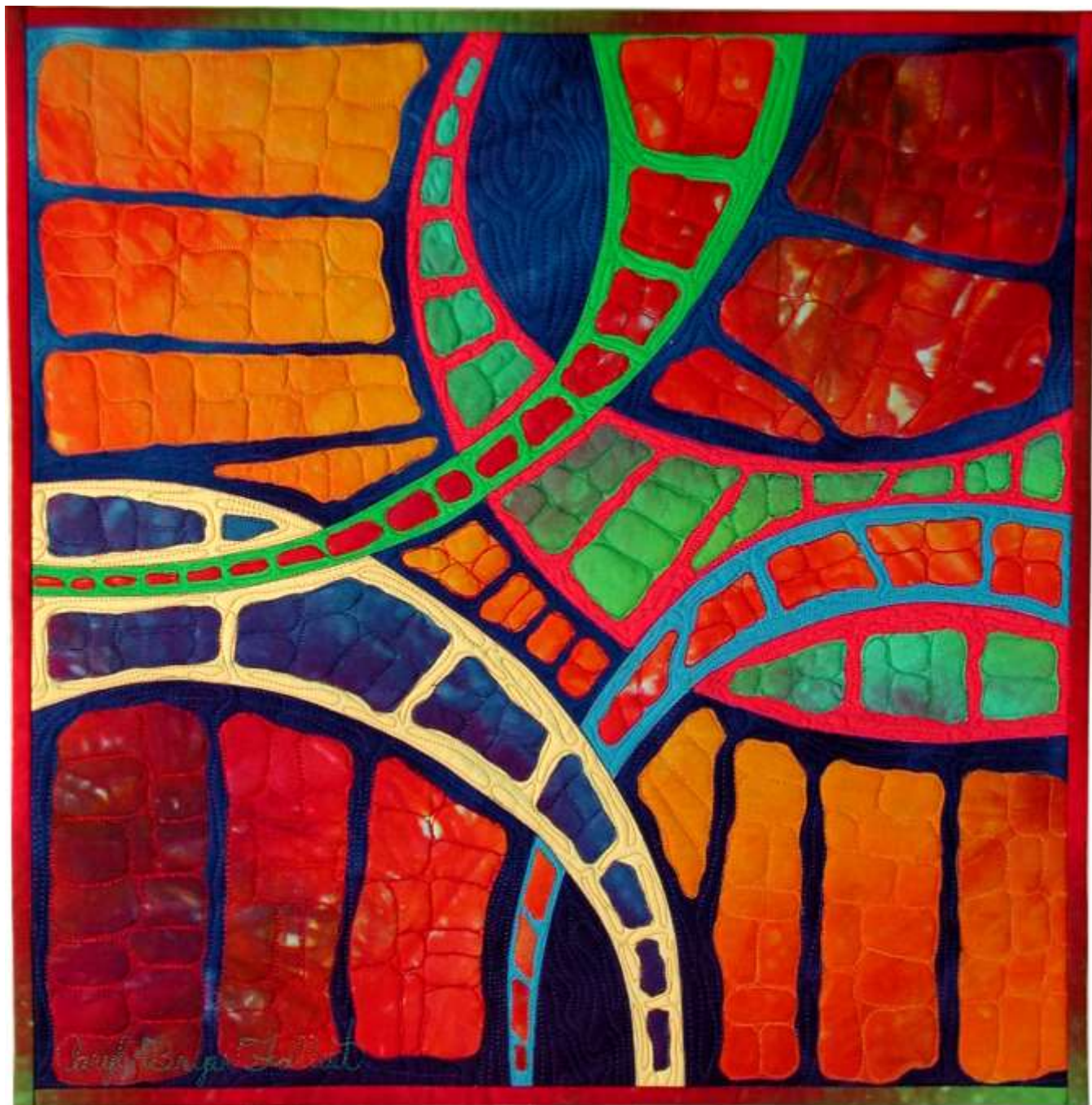
Giraffes in the Paintbox #1 • 18" x 18" • Copyright © 2001 Caryl Bryer Fallert • www.bryerpatch.com

Bryerpatch Studio • 10 Baycliff Pl. • Port Townsend, WA 98368 • caryl@bryerpatch.com • www.bryerpatch.com