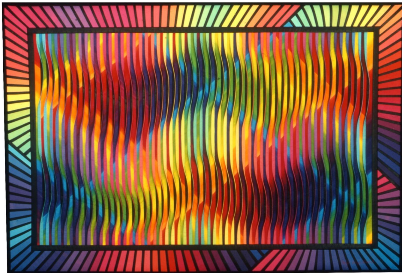
High Tech Tucks #34 • 43" x 64" • Copyright 1991 Caryl Bryer Fallert • Bryerpatch Studio • www.bryerpatch.com

Bryerpatch Studio • caryl@bryerpatch.com • www.bryerpatch.com