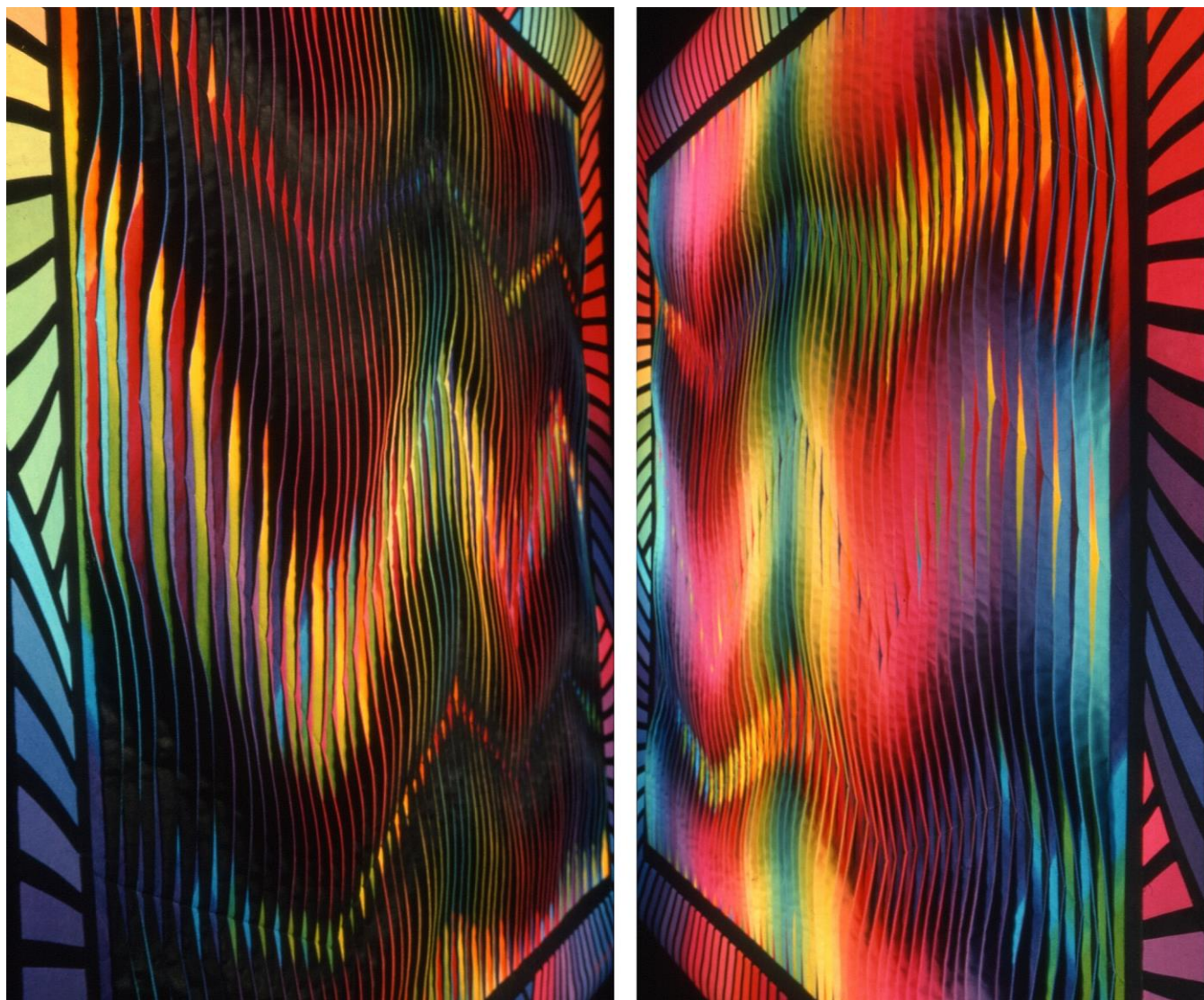
High Tech Tucks #34 (side views) • 43" x 64" • Copyright 1991 Caryl Bryer Fallert • Bryerpatch Studio • www.bryerpatch.com

Bryerpatch Studio • caryl@bryerpatch.com • www.bryerpatch.com