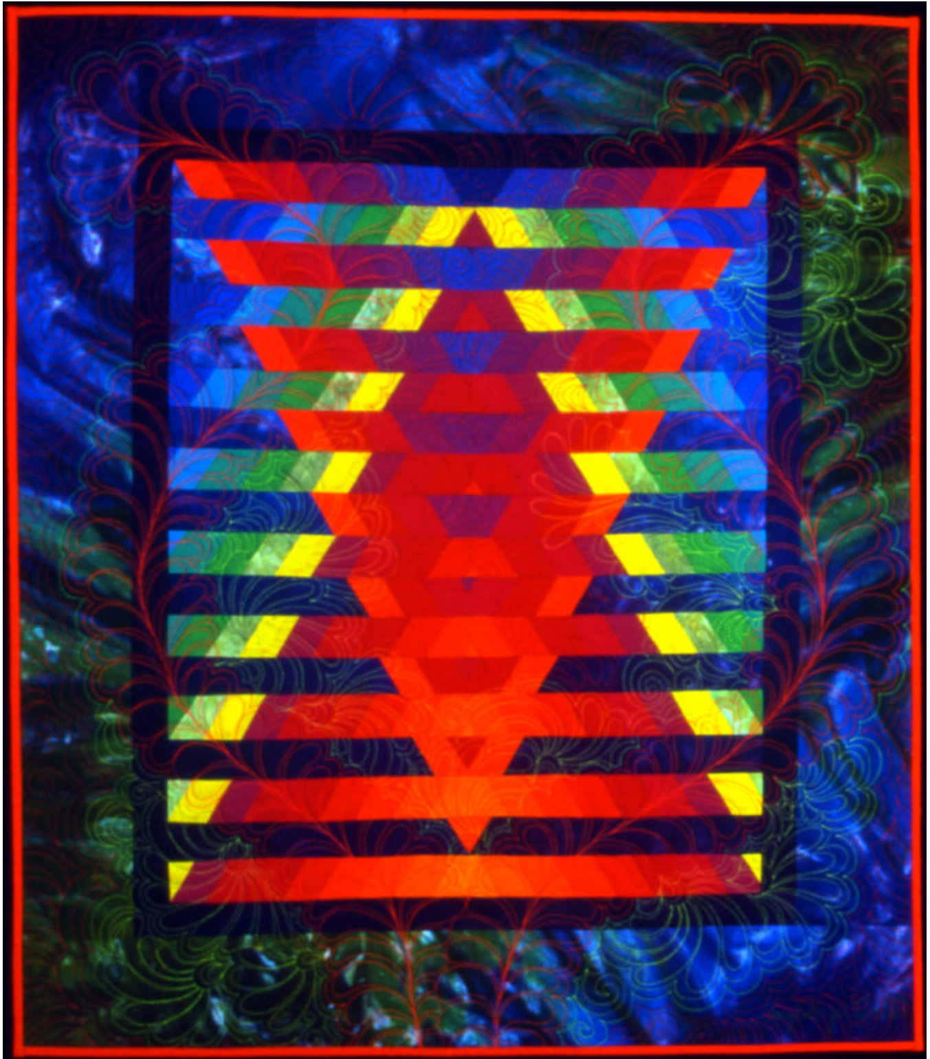
Illusion #31 • 26" x 29" • Copyright © 2000 Caryl Bryer Fallert • Bryerpatch Studio • www.bryerpatch.com