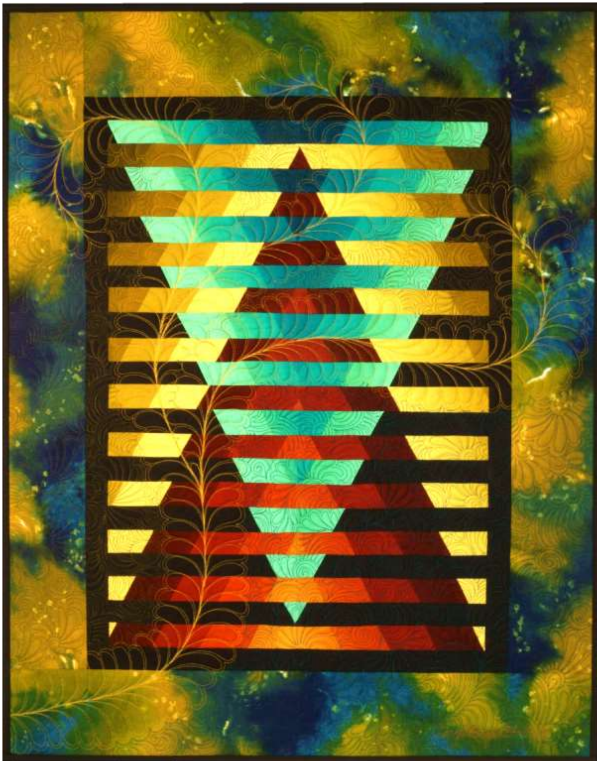
Illusion #43 • 24" x 30" • Copyright 2010 © Caryl Bryer Fallert • Bryerpatch Studio • www.bryerpatch.com

Bryerpatch Studio • 10 Baycliff Pl. • Port Townsend, WA 98368 • caryl@bryerpatch.com • www.bryerpatch.com