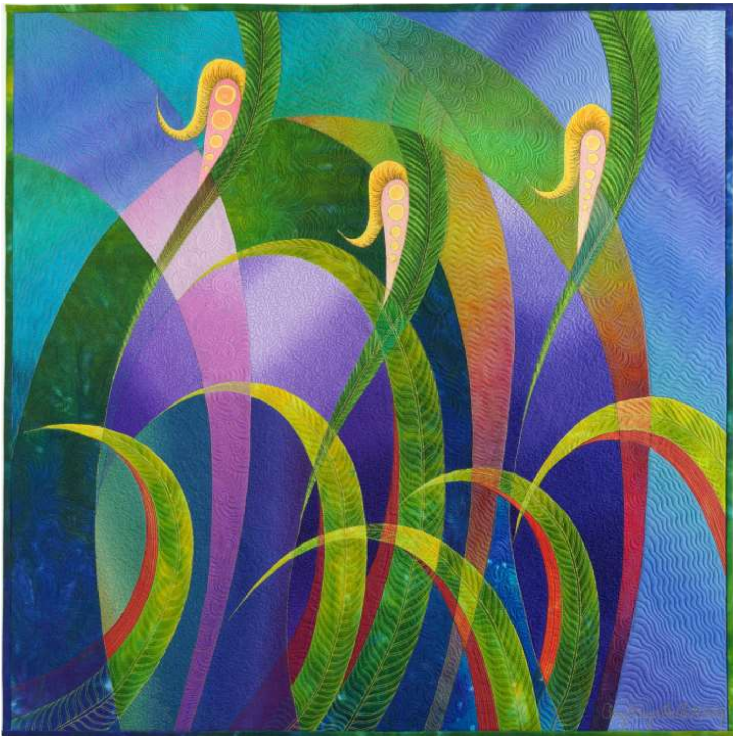
In the Marsh #2 • 30" x 30" • Copyright © 2014 Caryl Bryer Fallert-Gentry • Bryerpatch Studio • www.bryerpatch.com

Bryerpatch Studio • 10 Baycliff Pl. • Port Townsend, WA 98368 • caryl@bryerpatch.com • www.bryerpatch.com