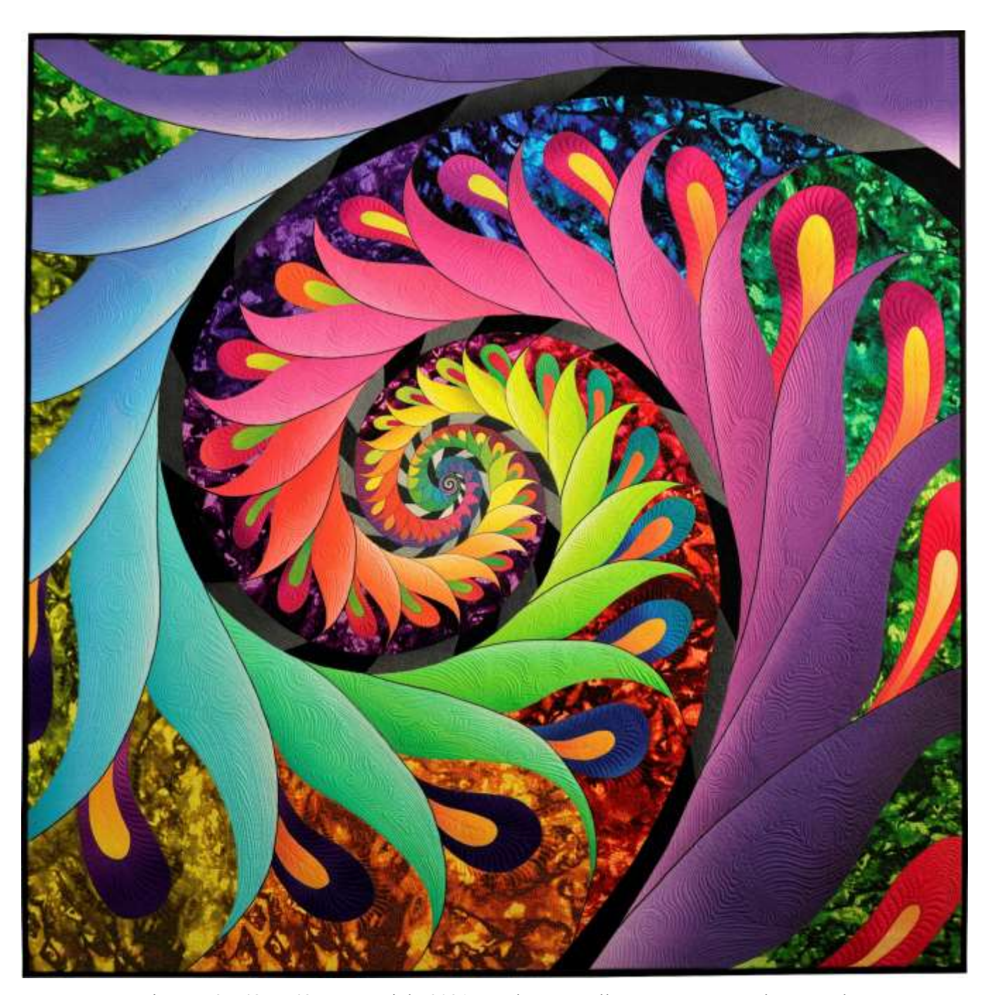
Jacuzzi Jazz #2 • 48" x 48" • Copyright 2021 Caryl Bryer Fallert-Gentry • www.bryerpatch.com

Bryerpatch Studio • 10 Baycliff Pl. • Port Townsend, WA 98368 • caryl @bryerpatch.com • www.bryerpatch.com