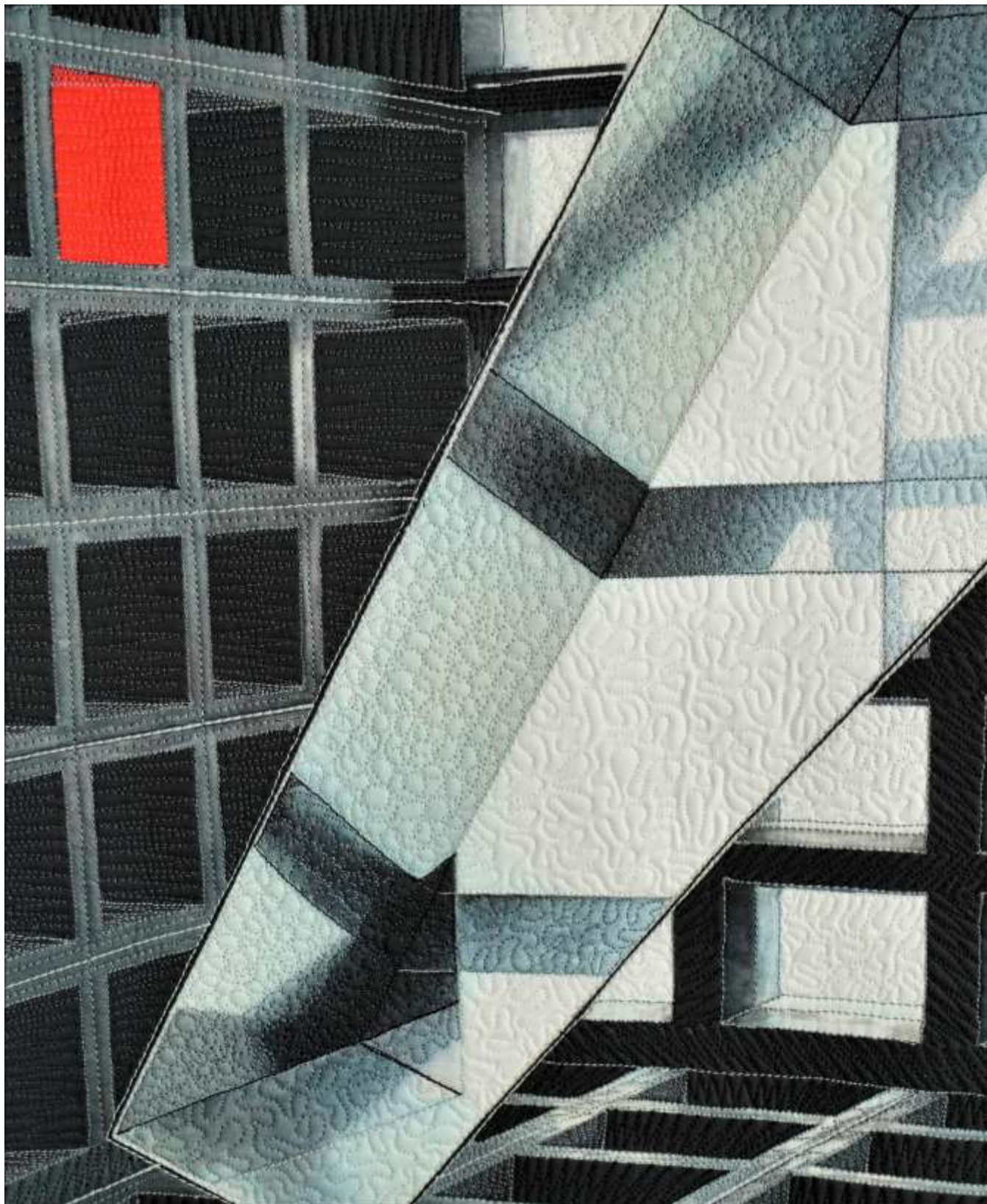
MONA Perspective (detail) • 39.5" x 39.75" • Copyright 2023 © Caryl Bryer Fallert-Gentry • www.bryerpatch.com