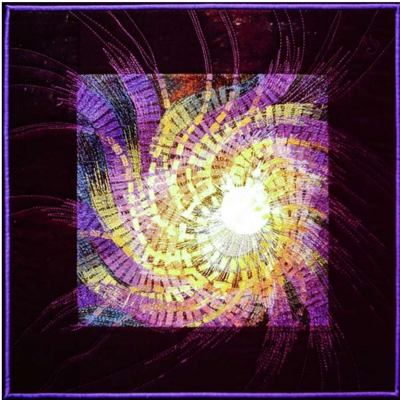
Magnetic Field • 22" x 22" • Copyright 1989 Caryl Bryer Fallert • www/bryerpatch.com

Bryerpatch Studio • 10 Baycliff Pl. • Port Townsend, WA 98368 • caryl@bryerpatch.com • www.bryerpatch.com