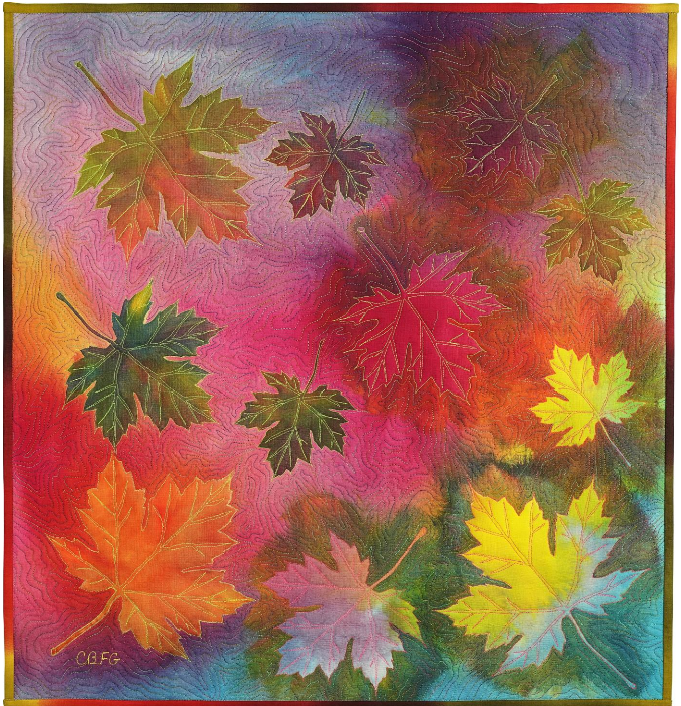
Maple Leaf Rag • 21" x 22" • Copyright © 2026 Caryl Bryer Fallert-Gentry • www.bryerpatch.com