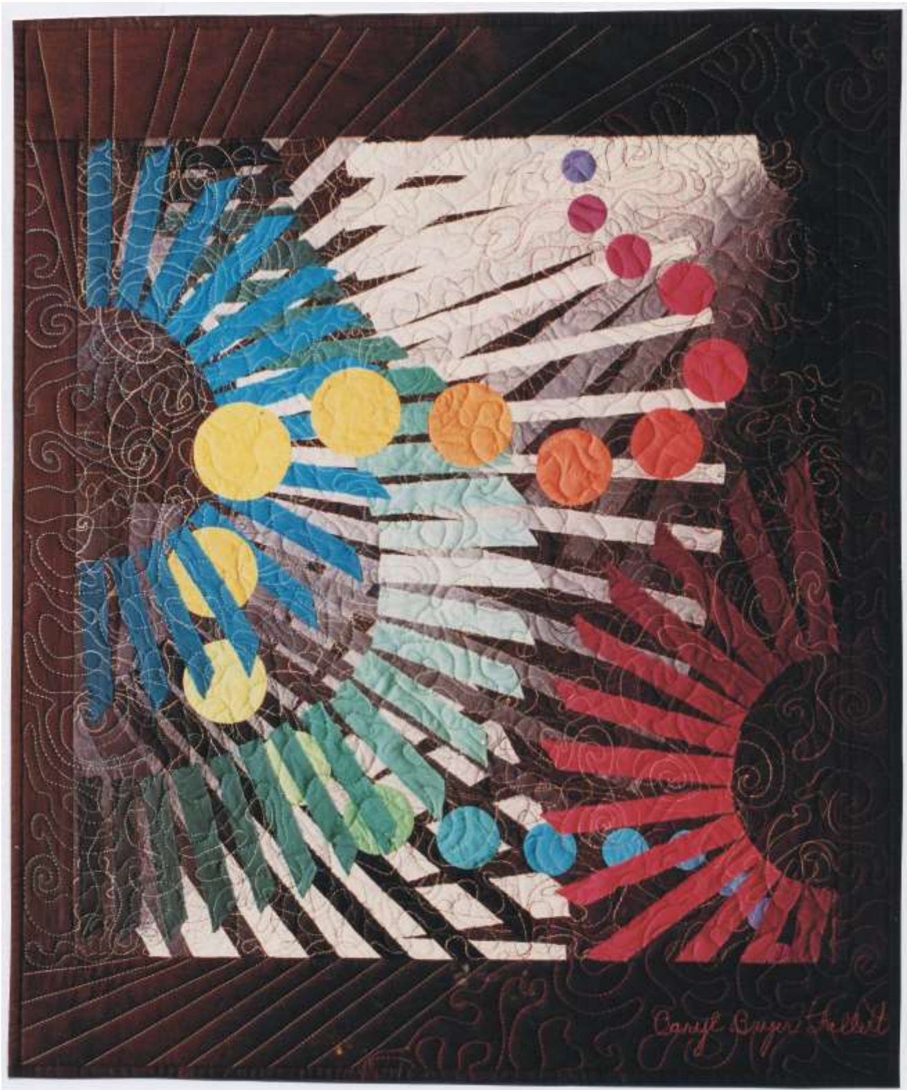
Life in the Margins #4 • 31" x 28.5" • Copyright © 1990 Caryl Bryer Fallert

Bryerpatch Studio • 10 Baycliff Pl. • Port Townsend, WA 98368 • caryl@bryerpatch.com • www.bryerpatch.com