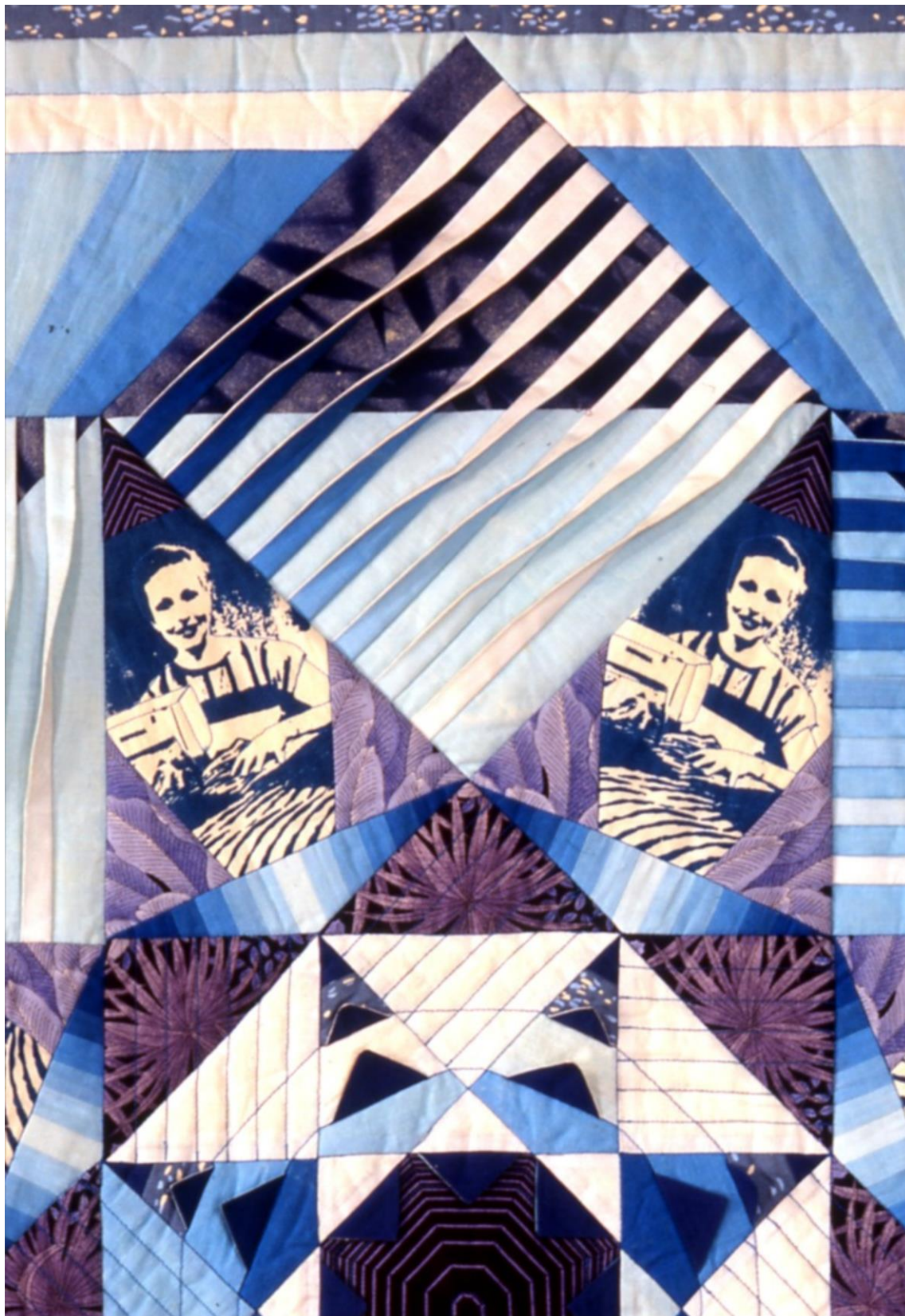
Me & My 404 Blues (detail) • Copyright © 1987 Caryl Bryer Fallert • 52" x 52" • Bryerpatch Studio • www.bryerpatch.com

Bryerpatch Studio • 10 Baycliff Pl. • Port Townsend, WA 98368 • caryl@bryerpatch.com • www.bryerpatch.com