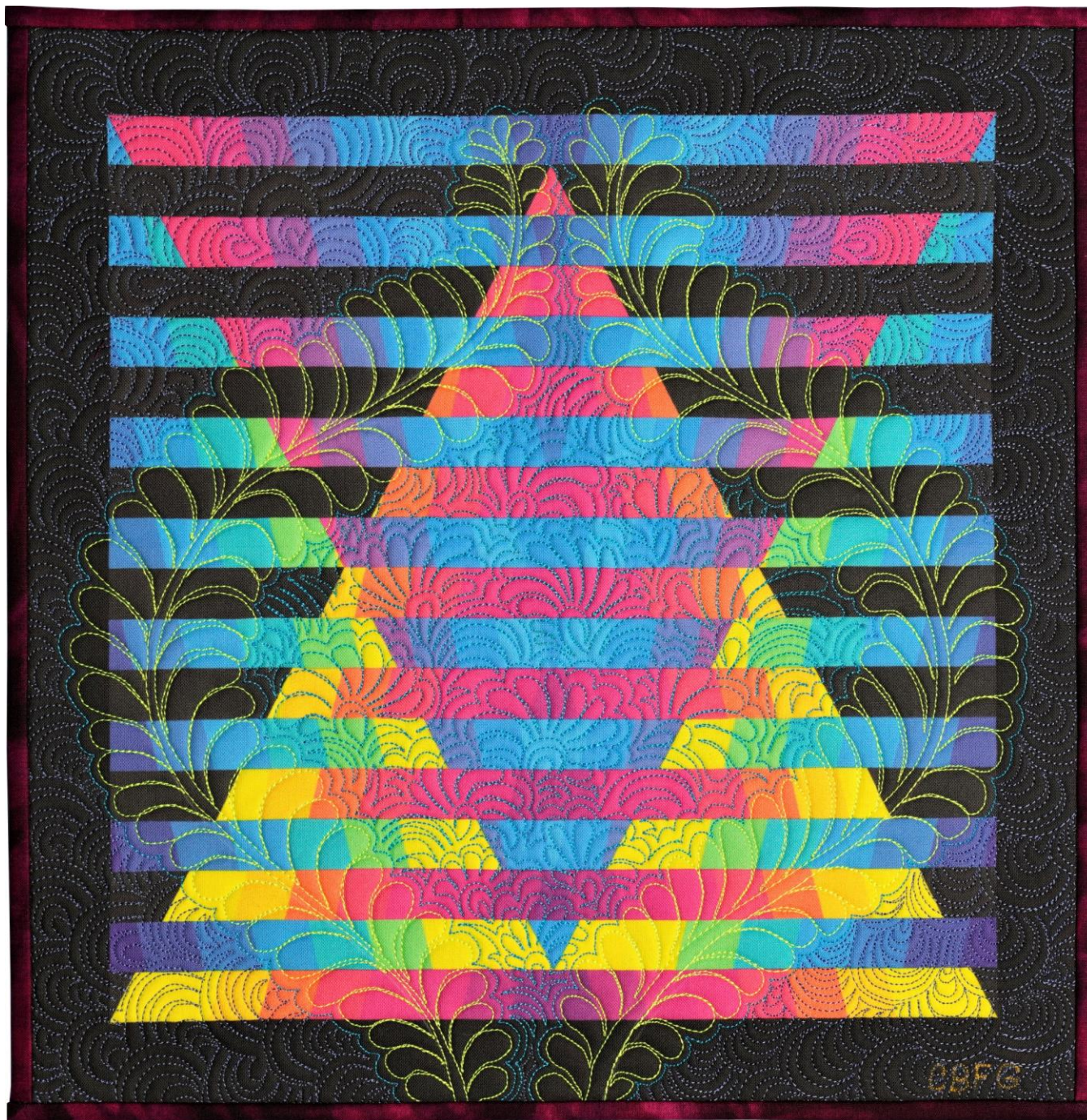
Miniature 2020G • 12" x 12.25" • Copyright © 2020 Caryl Bryer Fallert-Gentry • www.bryerpatch.com

Bryerpatch Studio • 10 Baycliff Pl. • Port Townsend, WA 98368 • caryl@bryerpatch.com • www.bryerpatch.com