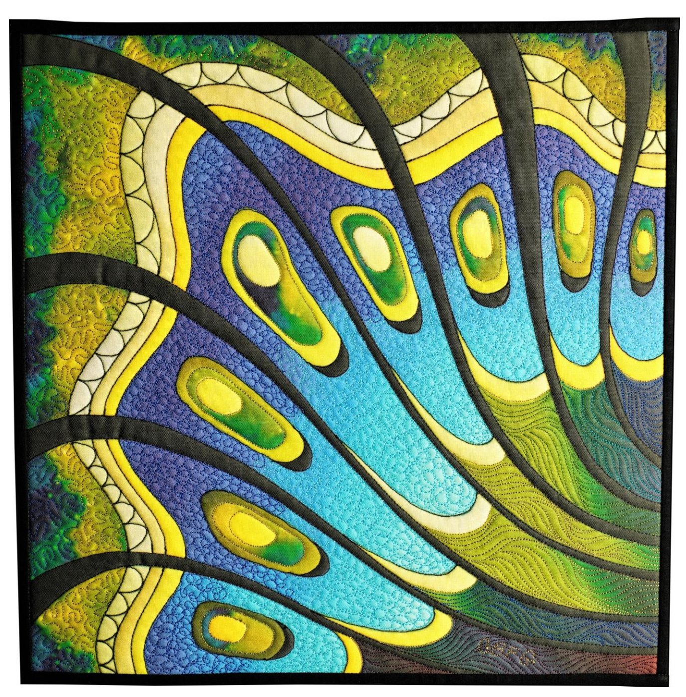
Miniature 2020A • Copyright © 2020 Caryl Bryer Fallert-Gentry • www.bryerpatch.com

Bryerpatch Studio • 10 Baycliff Pl. • Port Townsend, WA 98368 • caryl @bryerpatch.com • www.bryerpatch.com