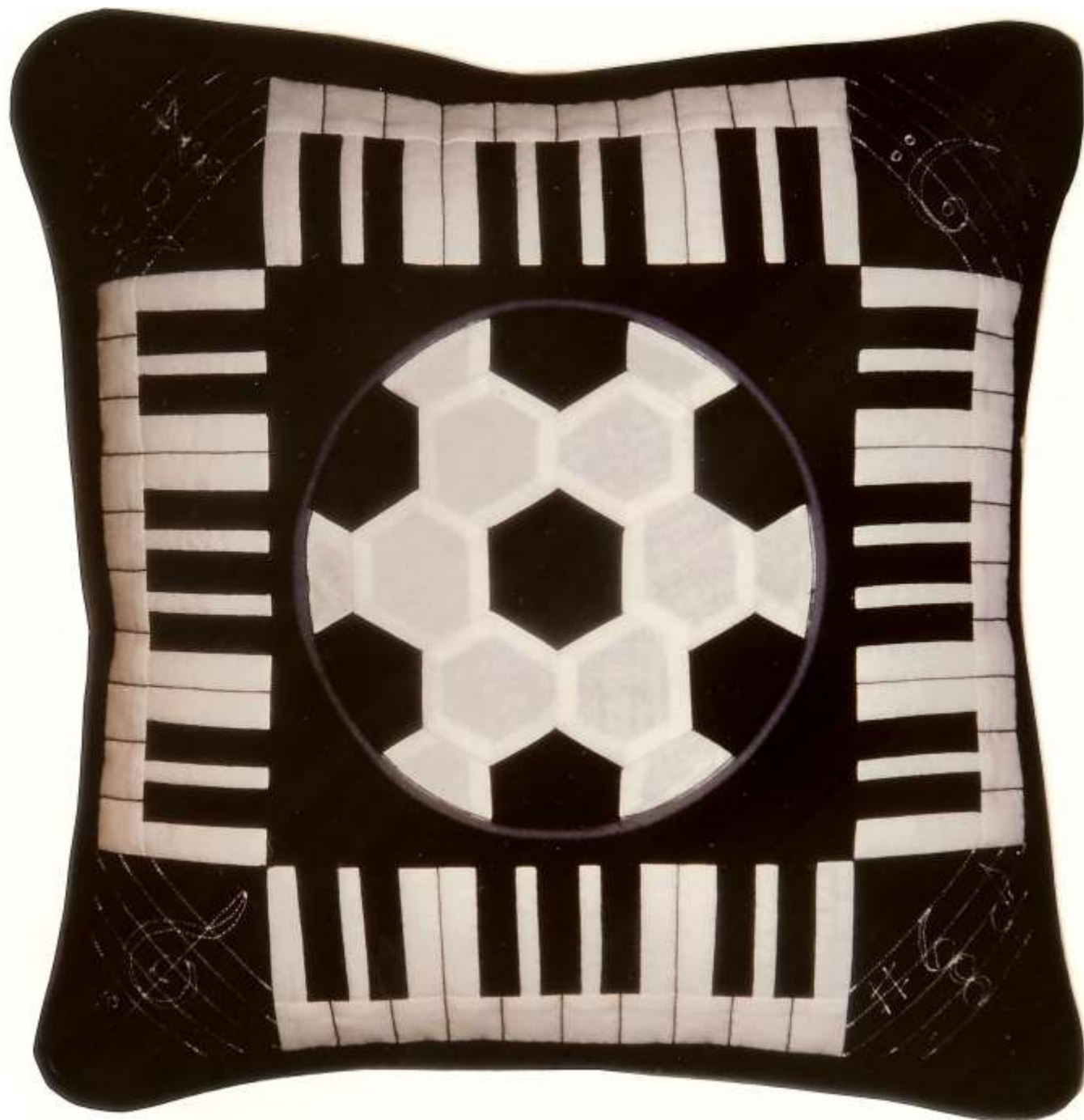
Piano and Soccer Pillow • Copyright © 1984 Caryl Bryer Fallert-Gentry • Bryerpatch Studio • www.bryerpatch.com

Bryerpatch Studio • 10 Baycliff Pl. • Port Townsend, WA 98368 • caryl@bryerpatch.com • www.bryerpatch.com