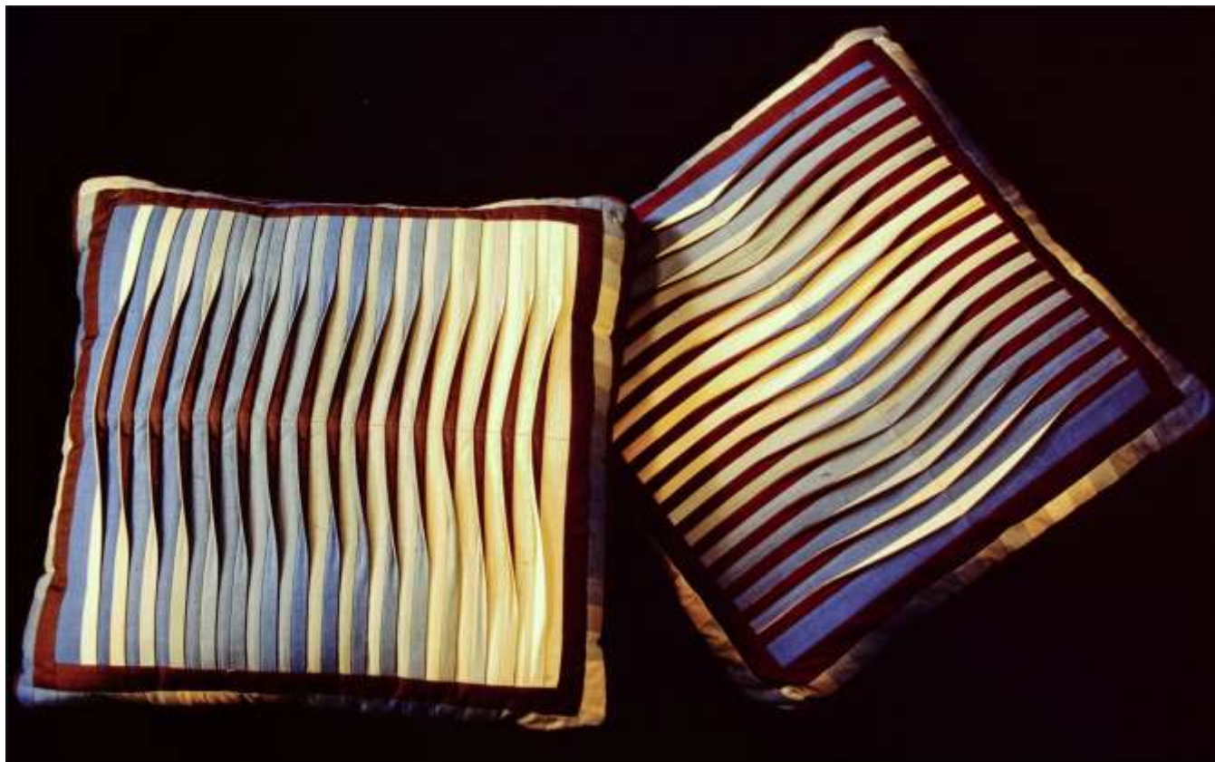
High Tech Tucks Pillows • Copyright 1988 Caryl Bryer Fallert • Bryerpatch Studio • www.bryerpatch.com

Bryerpatch Studio • 10 Baycliff Pl. • Port Townsend, WA 98368 • caryl@bryerpatch.com • www.bryerpatch.com