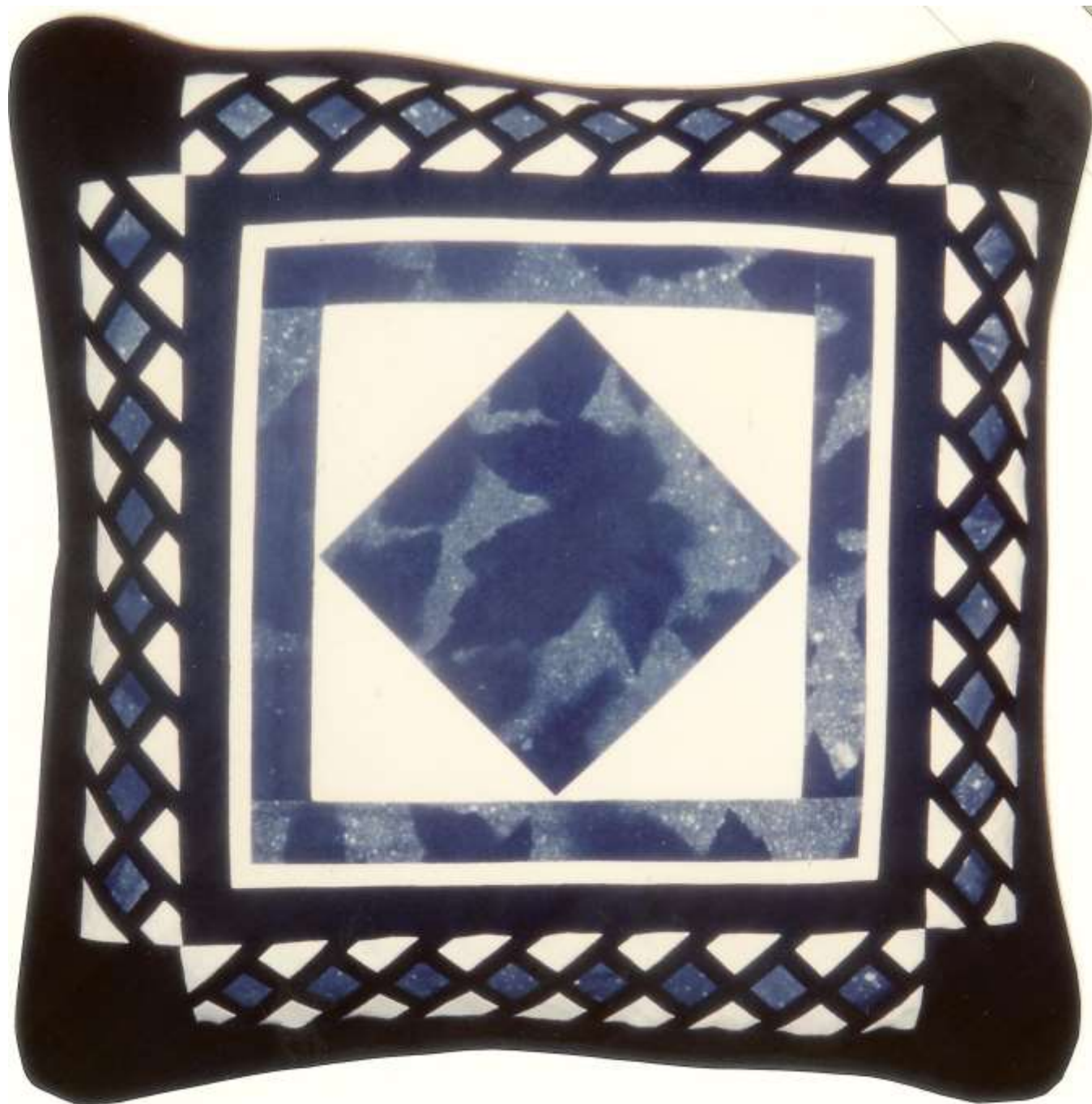
Blue Maple Pillow • Copyright © 1984 Caryl Bryer Fallert-Gentry • Bryerpatch Studio • www.bryerpatch.com

Bryerpatch Studio • 10 Baycliff Pl. • Port Townsend, WA 98368 • caryl@bryerpatch.com • www.bryerpatch.com