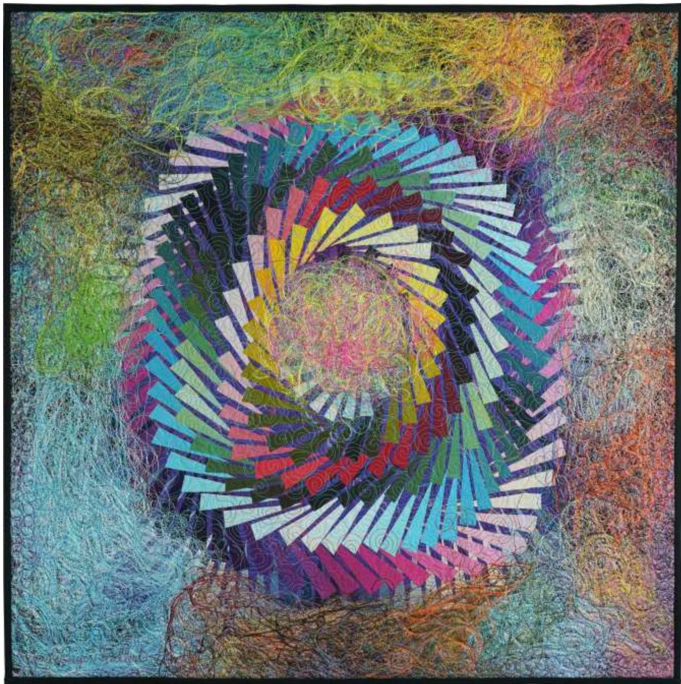
Polyneon Puree • 30" x 30" • Copyright © 2023 Caryl Bryer Fallert-Gentry • www.bryerpatch.com

Bryerpatch Studio • 10 Baycliff Pl. • Port Townsend, WA 98368 • caryl@bryerpatch.com • www.bryerpatch.com