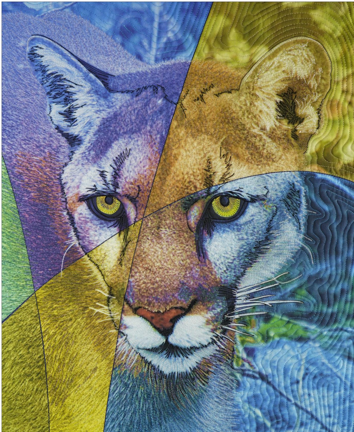
Purr (detail) • 30" x 40" • Copyright © 2025 Caryl Bryer Fallert-Gentry • www.bryerpatch.com