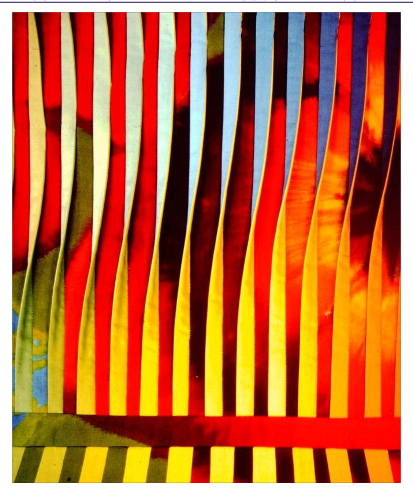
Reflection #16 (detail) • 40" x 48" • Copyright 1991 Caryl Bryer Fallert • Bryerpatch Studio • www.bryerpatch.com

Bryerpatch Studio • 10 Baycliff Pl. • Port Townsend, WA 98368 • caryl @bryerpatch.com • www.bryerpatch.com