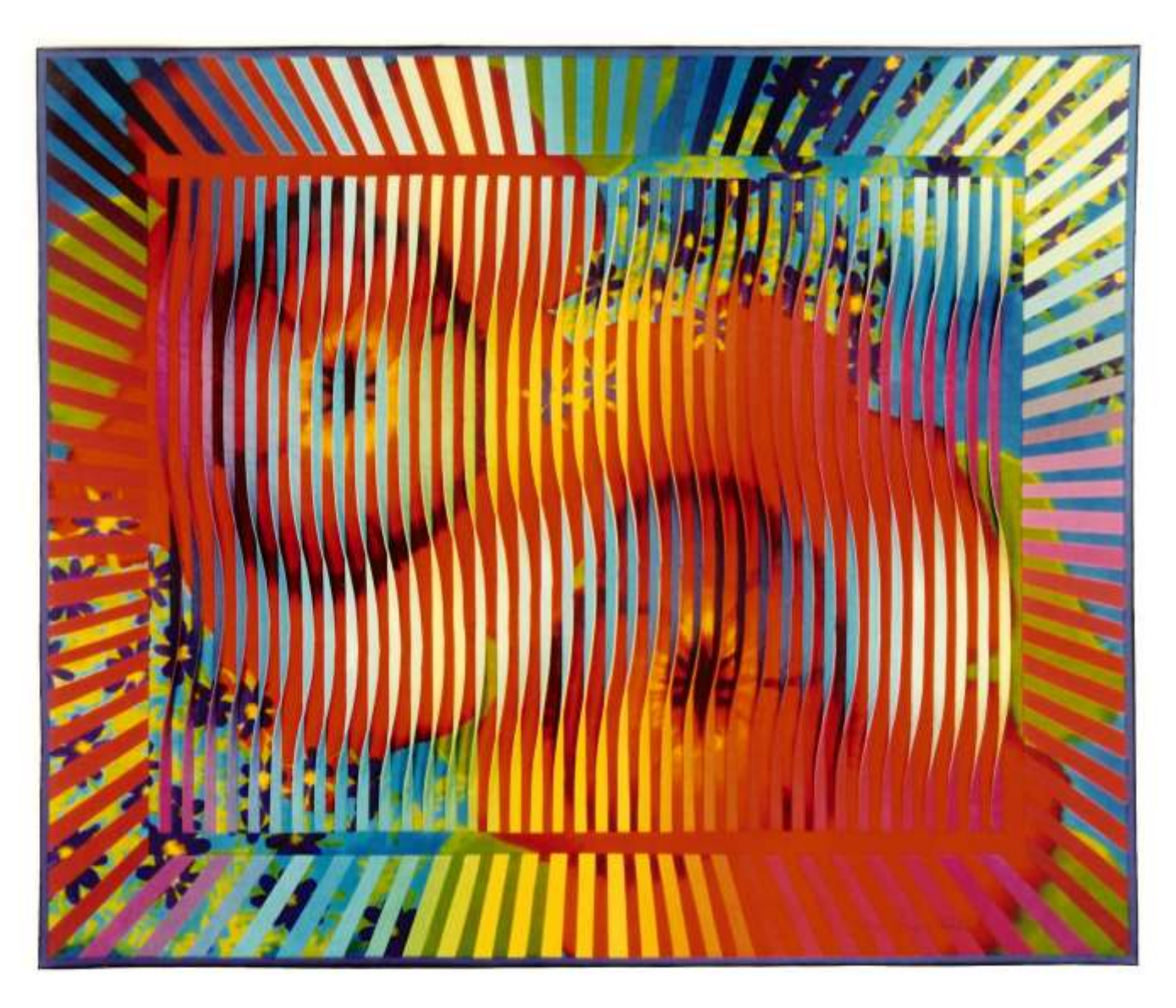
Reflection #16 • 40" x 48" • Copyright 1991 Caryl Bryer Fallert • Bryerpatch Studio • <u>www.bryerpatch.com</u>

Bryerpatch Studio • 10 Baycliff Pl. • Port Townsend, WA 98368 • caryl @bryerpatch.com • www.bryerpatch.com