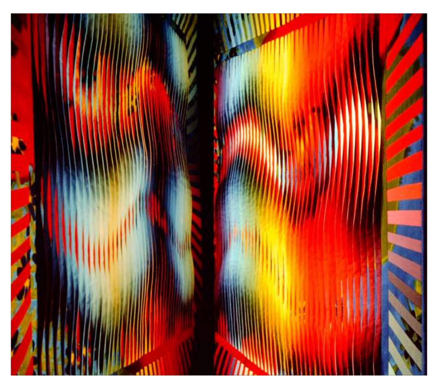
Reflection #16 (Side Views) • 40" x 48" • Copyright 1991 Caryl Bryer Fallert • Bryerpatch Studio • www.bryerpatch.com

Bryerpatch Studio • 10 Baycliff Pl. • Port Townsend, WA 98368 • caryl @bryerpatch.com • www.bryerpatch.com