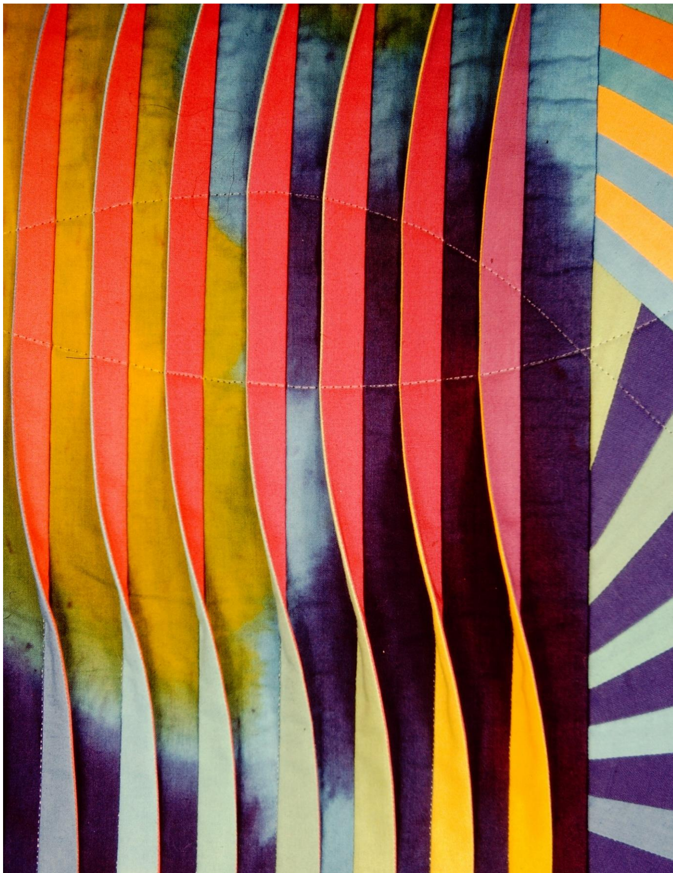
Reflection #20 (detail) • 33" x 35" • Copyright © 1992 Caryl Bryer Fallert • Bryerpatch Studio • www.bryerpatch.com

Bryerpatch Studios • Paducah, KY & Port Townsend, WA • 270-444-8040 • caryl@bryerpatch.com • www.bryerpatch.com