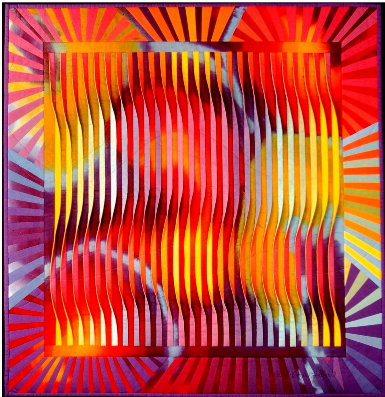
Reflection #20 • 33" x 35" • Copyright © 1992 Caryl Bryer Fallert • Bryerpatch Studio • www.bryerpatch.com

Bryerpatch Studios • Paducah, KY & Port Townsend, WA • 270-444-8040 • caryl@bryerpatch.com • www.bryerpatch.com