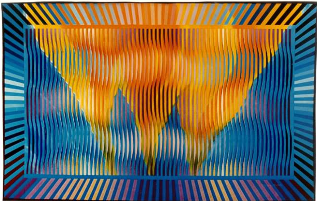
Reflection #23 • 46" x 73" • Copyright © 1992 Caryl Bryer Fallert • www.bryerpatch.com