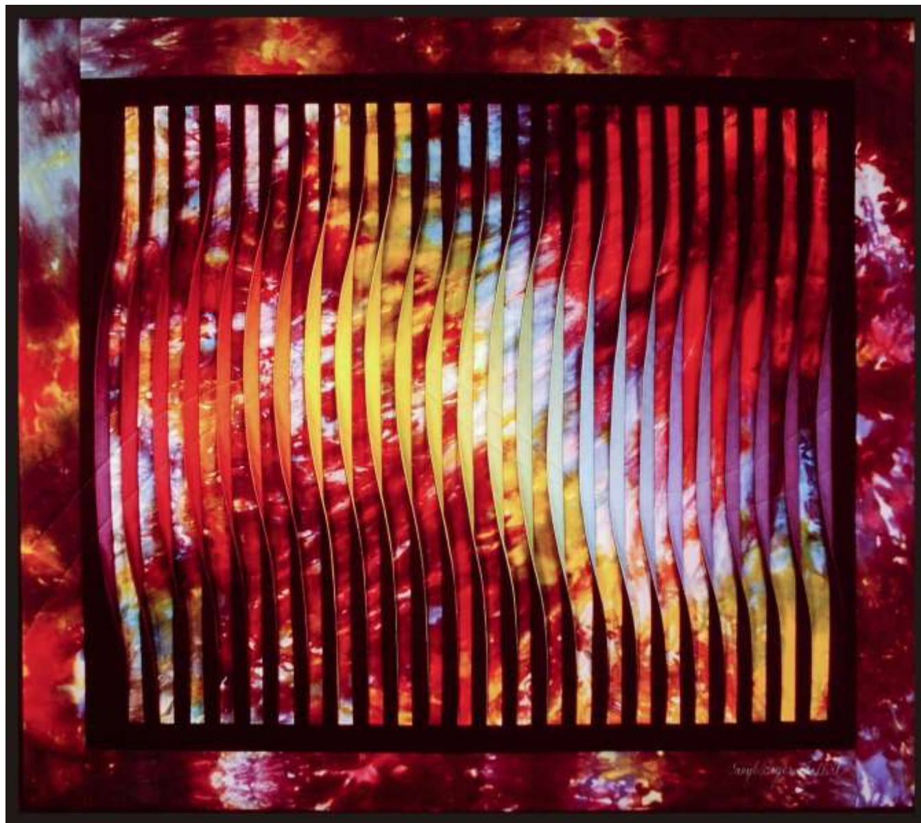
Reflection #31 • 27" x 30" • Copyright © 1993 Caryl Bryer Fallert • www.bryerpatch.com