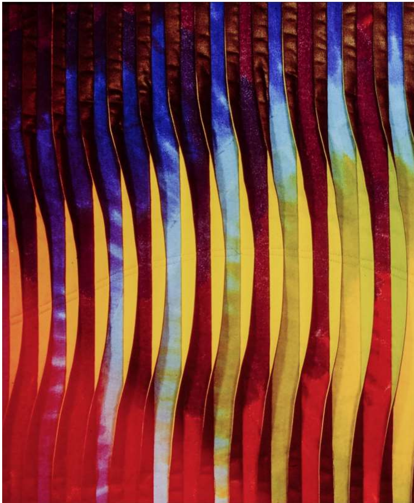
Reflection #34 (detail) • 49" x 68" • Copyright © 1993 Caryl Bryer Fallert • Bryerpatch Studio • www.bryerpatch.com

Bryerpatch Studio • 10 Baycliff Pl. • Port Townsend, WA 98368 • caryl@bryerpatch.com • www.bryerpatch.com