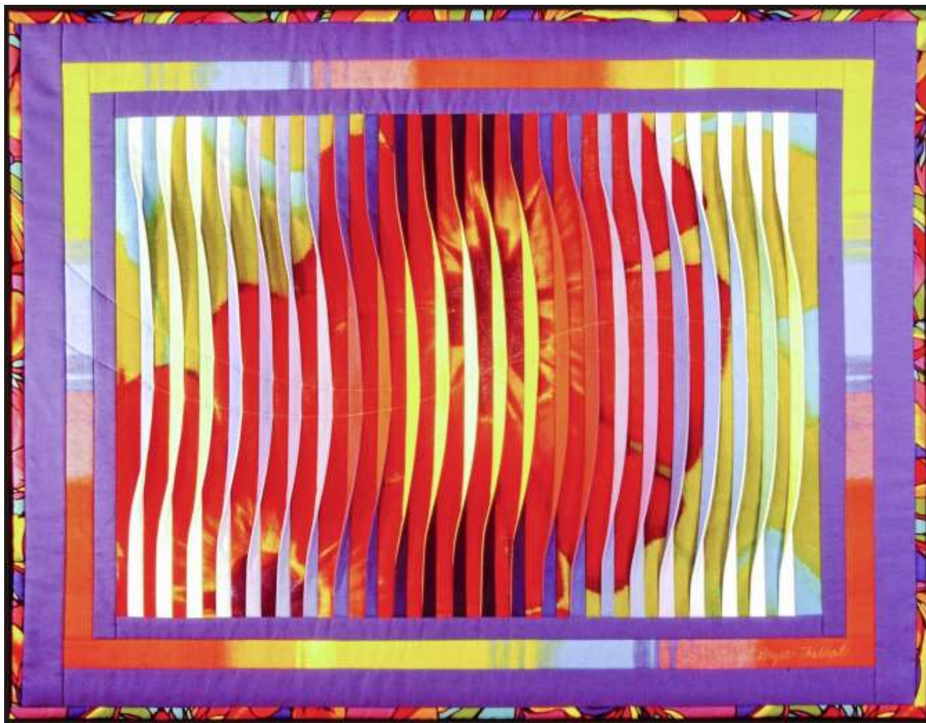
Reflection #39 • 32" x 23" • Copyright © 1994 Caryl Bryer Fallert • www.bryerpatch.com