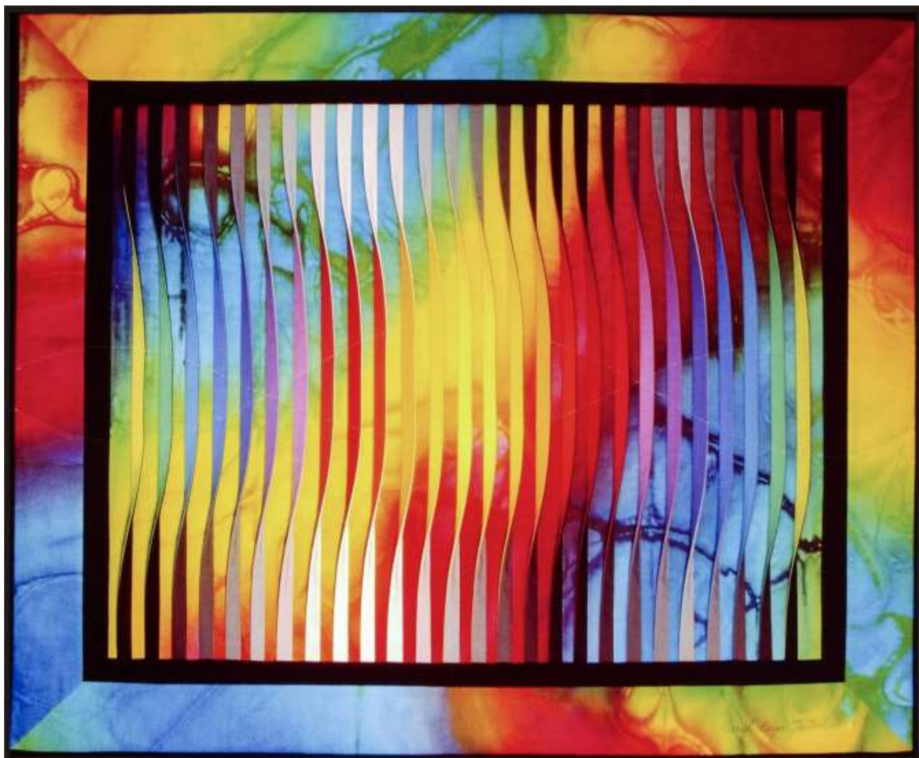
Reflection #41 • 27" x 22" • Copyright © 1995 Caryl Bryer Fallert • www.bryerpatch.com

Bryerpatch Studio • 10 Baycliff Pl. • Port Townsend, WA 98368 • caryl@bryerpatch.com • www.bryerpatch.com