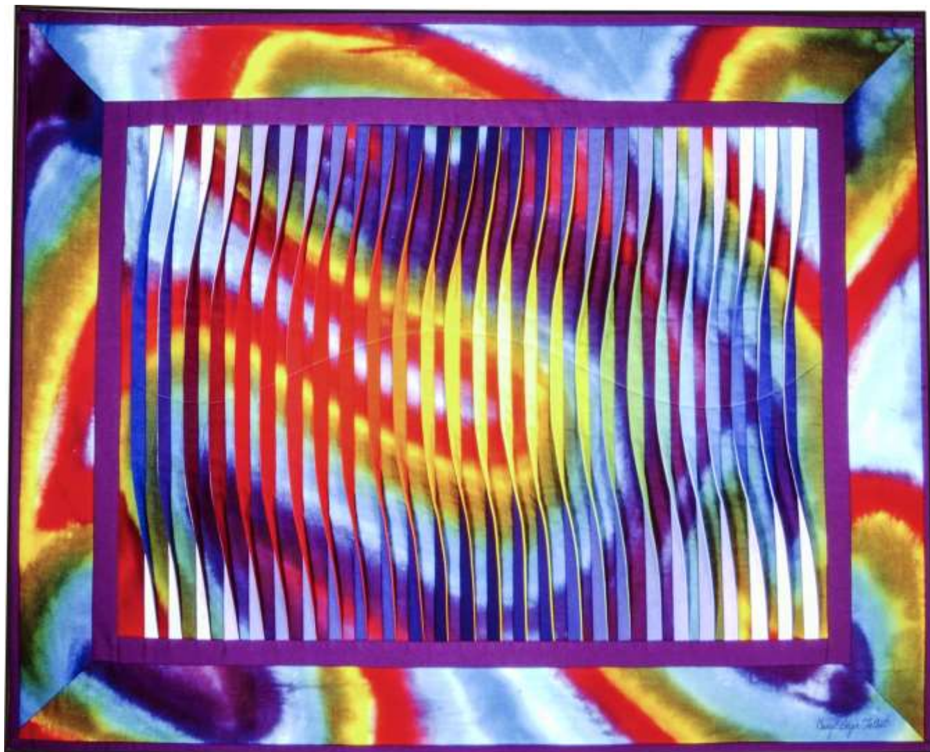
Reflection #42 • 26" x 35" • Copyright © 1996 Caryl Bryer Fallert • Bryerpatch Studio • www.bryerpatch.com

Bryerpatch Studio • 10 Baycliff Pl. • Port Townsend, WA 98368 • caryl@bryerpatch.com • www.bryerpatch.com