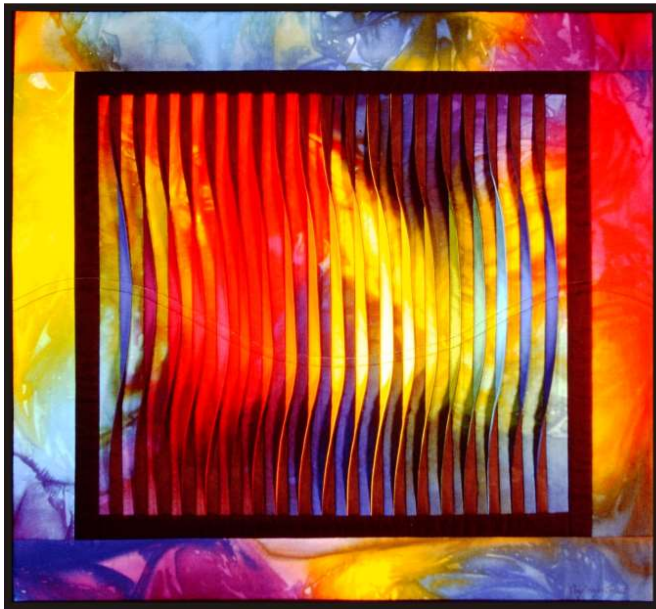
Reflection #49 • 25" x 27" • Copyright © 1997 Caryl Bryer Fallert • Bryerpatch Studio • www.bryerpatch.com

Bryerpatch Studio • 10 Baycliff Pl. • Port Townsend, WA 98368 • caryl@bryerpatch.com • www.bryerpatch.com