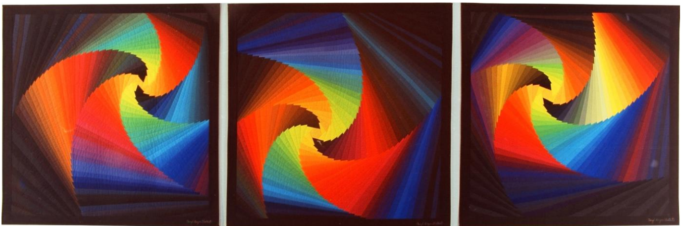
Reflection #35 • 30" x 42" • Copyright © 1994 Caryl Bryer Fallert • Bryerpatch Studio • www.bryerpatch.com