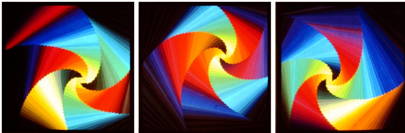
Refraction #8, 9, 10 • 40" x 126" • Copyright © 1993 Caryl Bryer Fallert • Bryerpatch Studio • www.bryerpatch.com

Bryerpatch Studio • 10 Baycliff Pl. • Port Townsend, WA 98368 • caryl@bryerpatch.com • www.bryerpatch.com