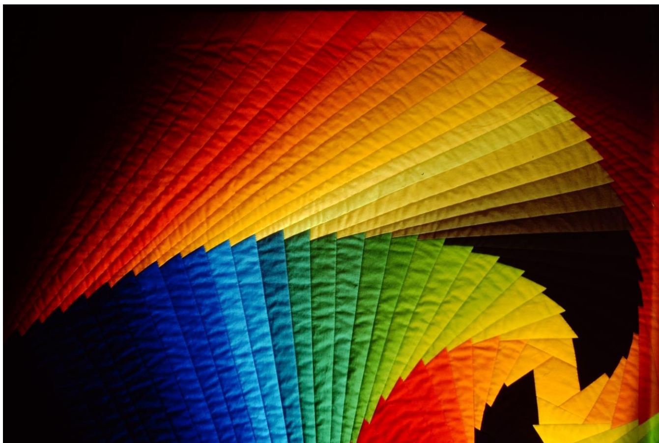
Refraction #8, 9, 10 (detail) • 40" x 126" • Copyright © 1993 Caryl Bryer Fallert • Bryerpatch Studio • www.bryerpatch.com