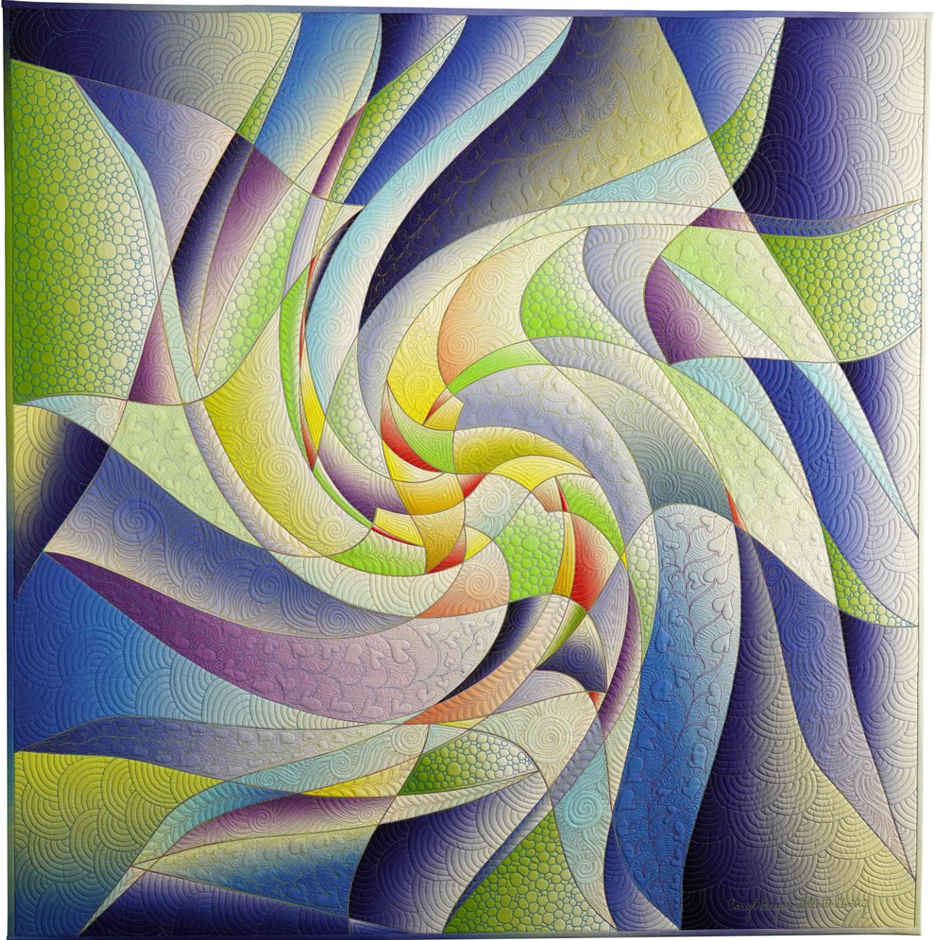
Tangent Edges #4 • 40" x 40.5" • Copyright © 2026 Caryl Bryer Fallert-Gentry • www.bryerpatch.com