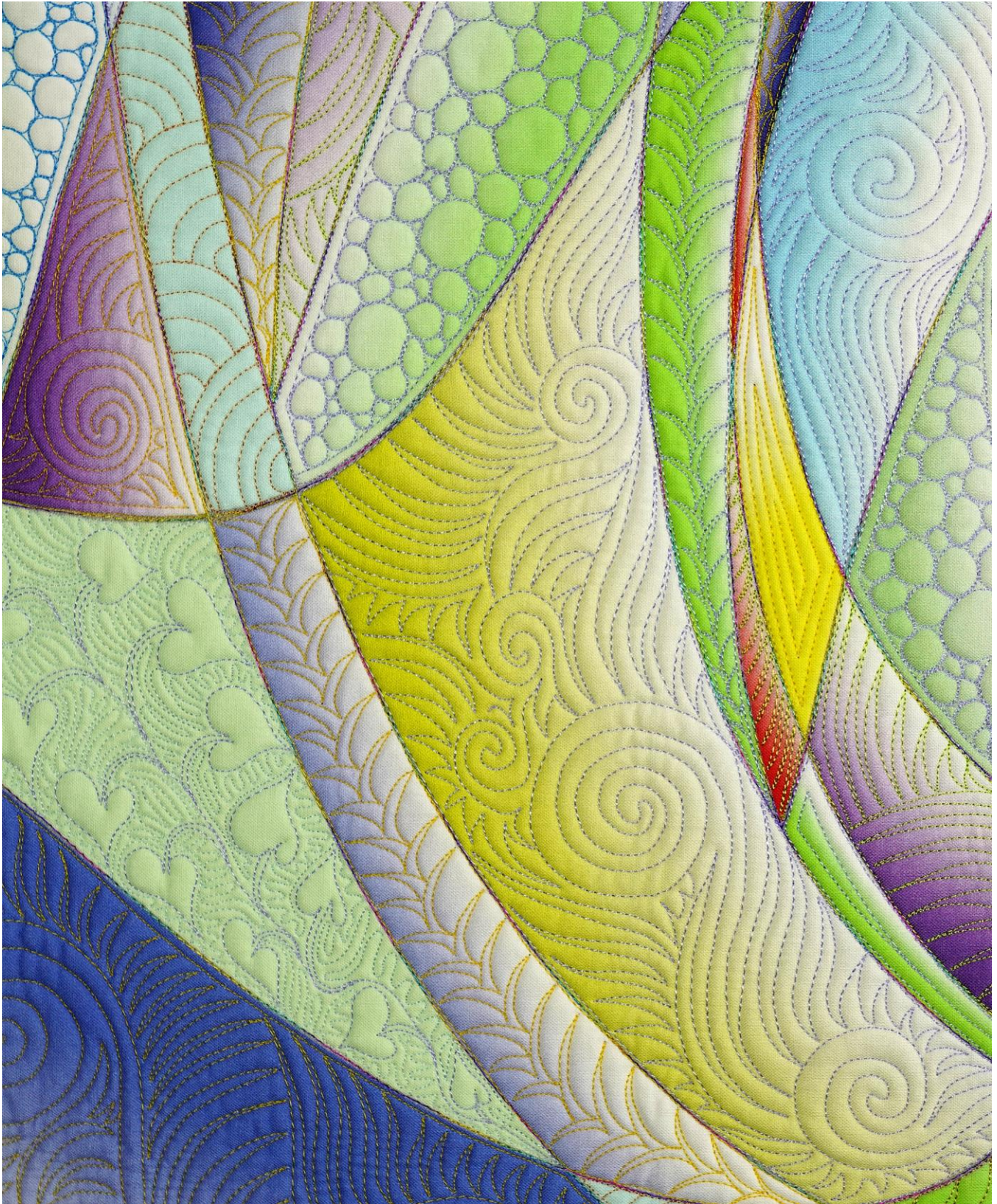
Tangent Edges #4 (detail) • 40" x 40.5" • Copyright © 2026 Caryl Bryer Fallert-Gentry • www.bryerpatch.com