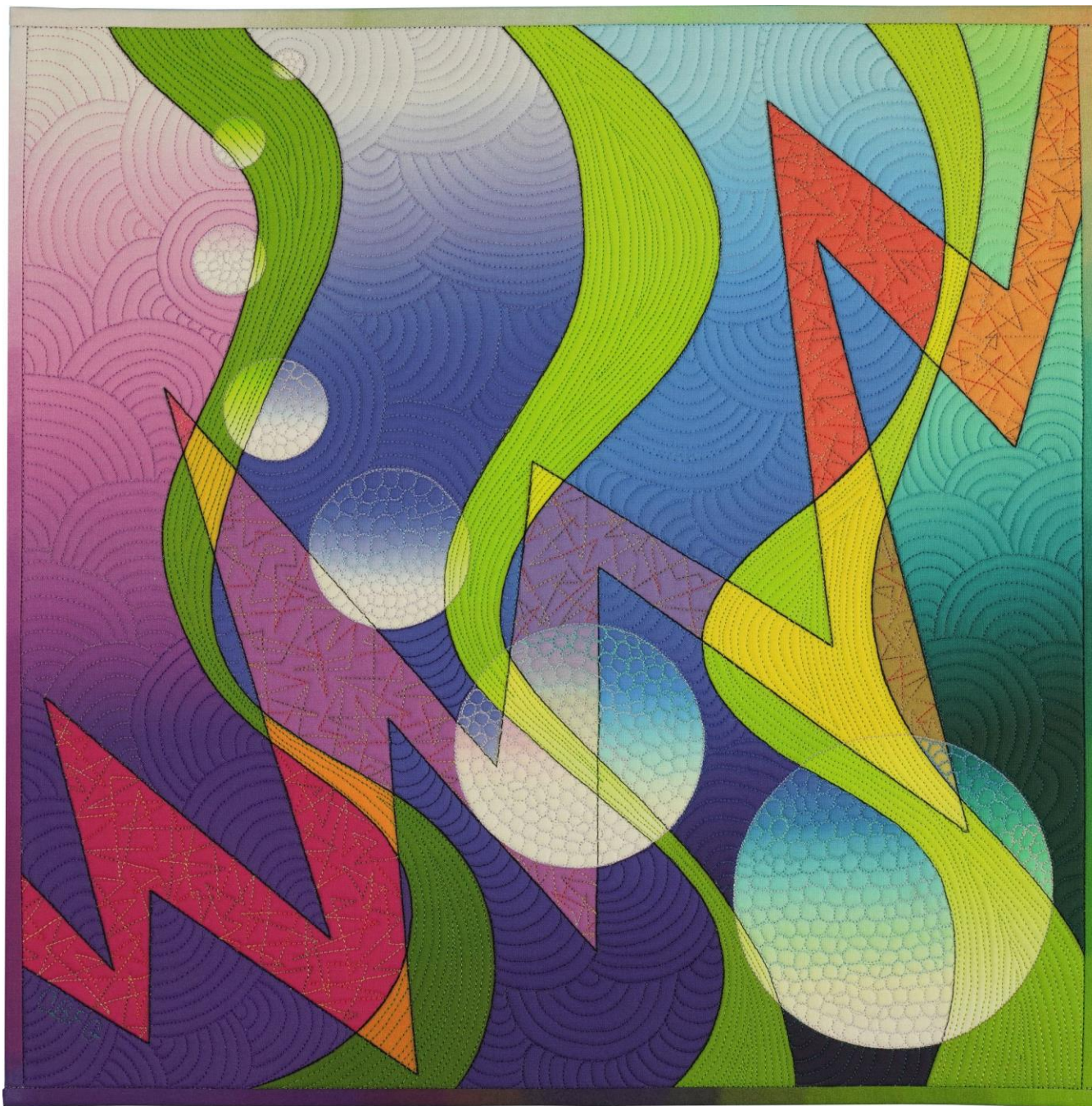
Through Thick & Thin #2 • 18" x 18" • Copyright © 2024 Caryl Bryer Fallert-Gentry • www.bryerpatch.com

Bryerpatch Studio • 10 Baycliff Pl. • Port Townsend, WA 98368 • caryl@bryerpatch.com • www.bryerpatch.com