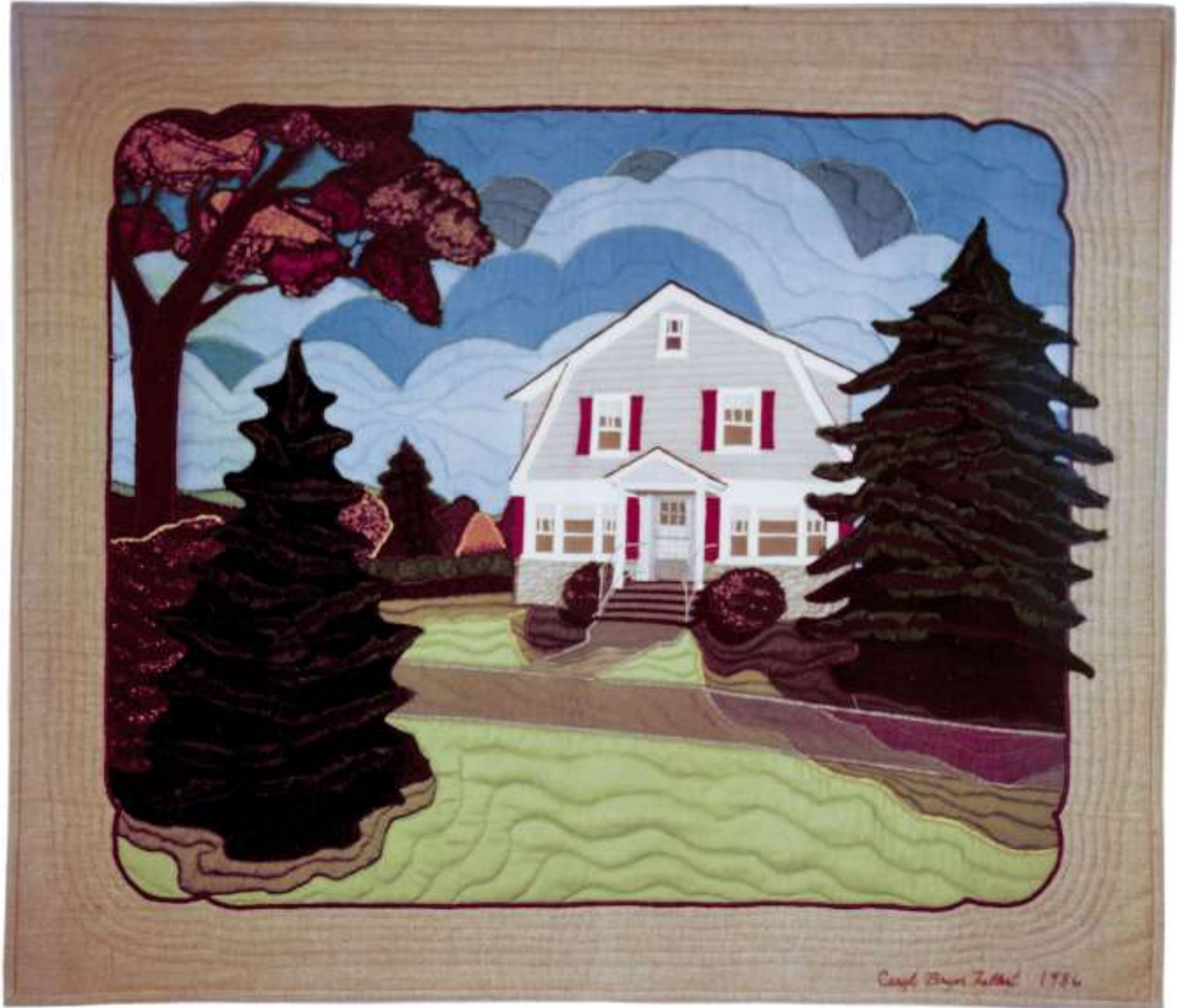
West Home • 39" x 34" • Copyright © 1986 Caryl Bryer Fallert • www.bryerpatch.com

Bryerpatch Studio • 10 Baycliff Pl. • Port Townsend, WA 98368 • caryl@bryerpatch.com • www.bryerpatch.com