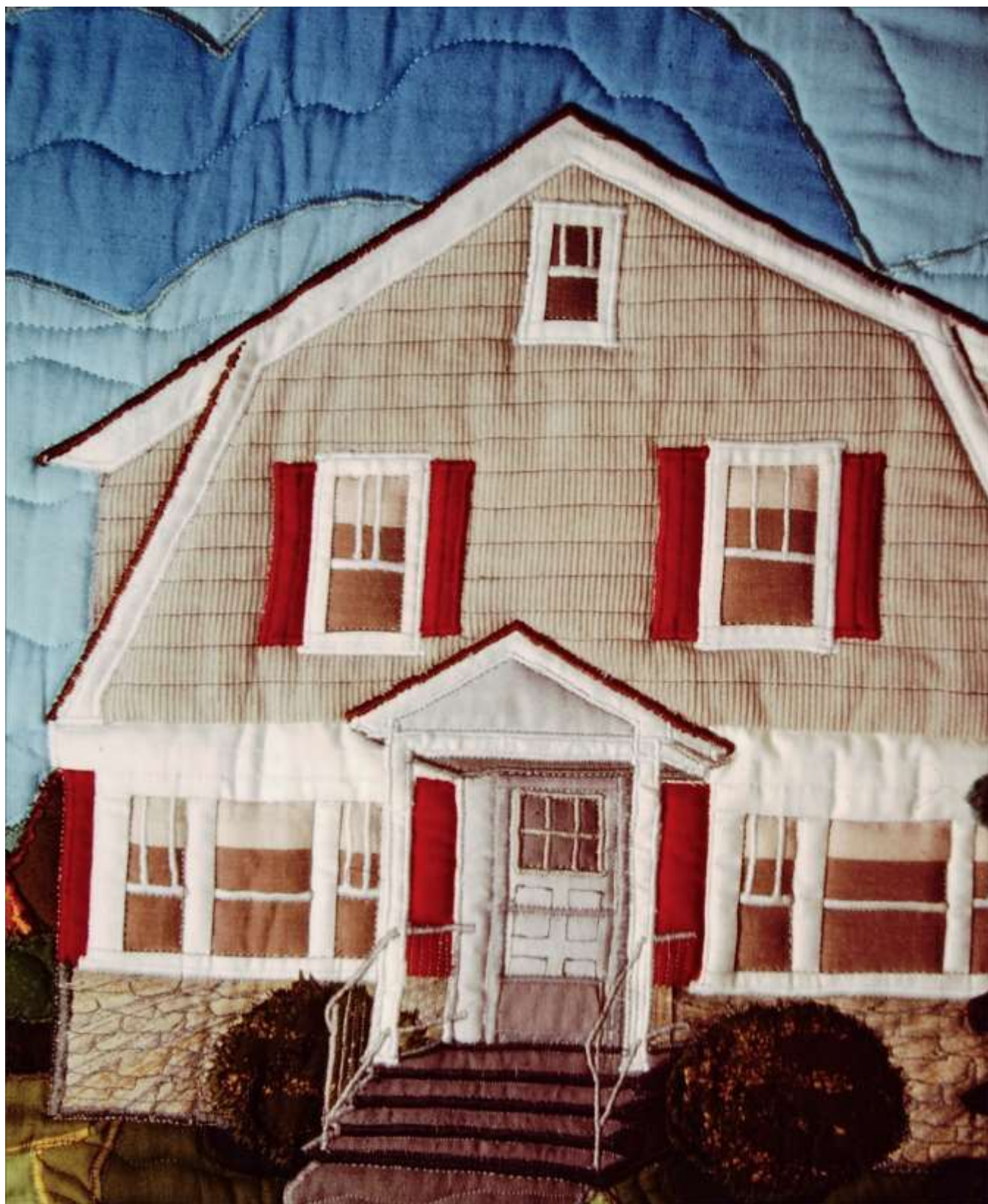
West Home (detail) • 39" x 34" • Copyright © 1986 Caryl Bryer Fallert • www.bryerpatch.com

Bryerpatch Studio • 10 Baycliff Pl. • Port Townsend, WA 98368 • caryl@bryerpatch.com • www.bryerpatch.com